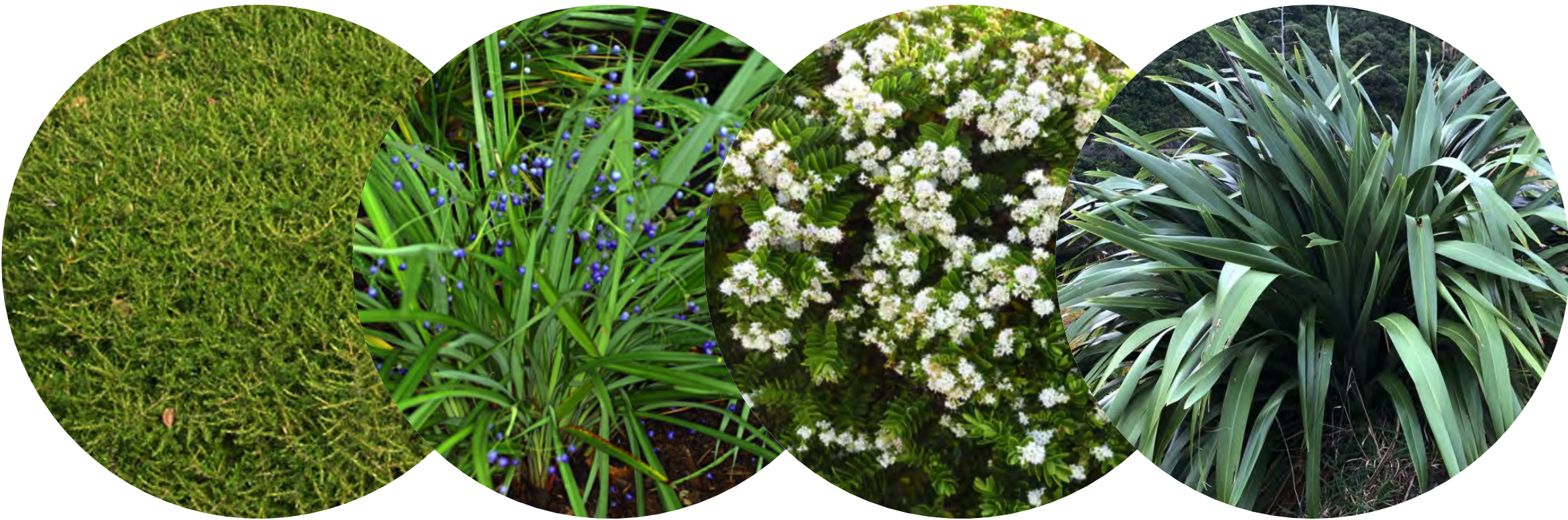
Coprosma 'Hawera' Dianella nigra Hebe 'Wiri Mist' Phormium cookianum