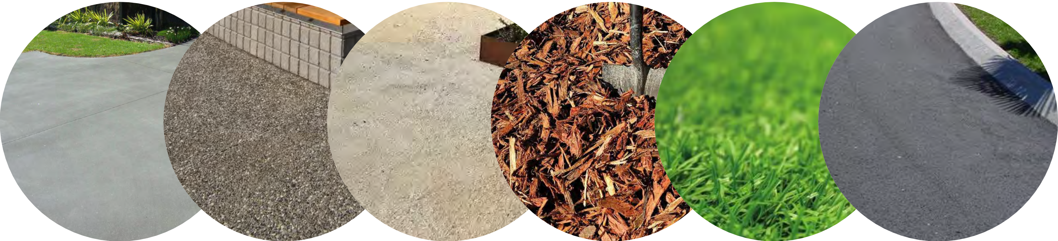
Standard concrete Exposed Agg. Concrete Hoggin Limestone Cambium bark mulch Lawn Asphalt