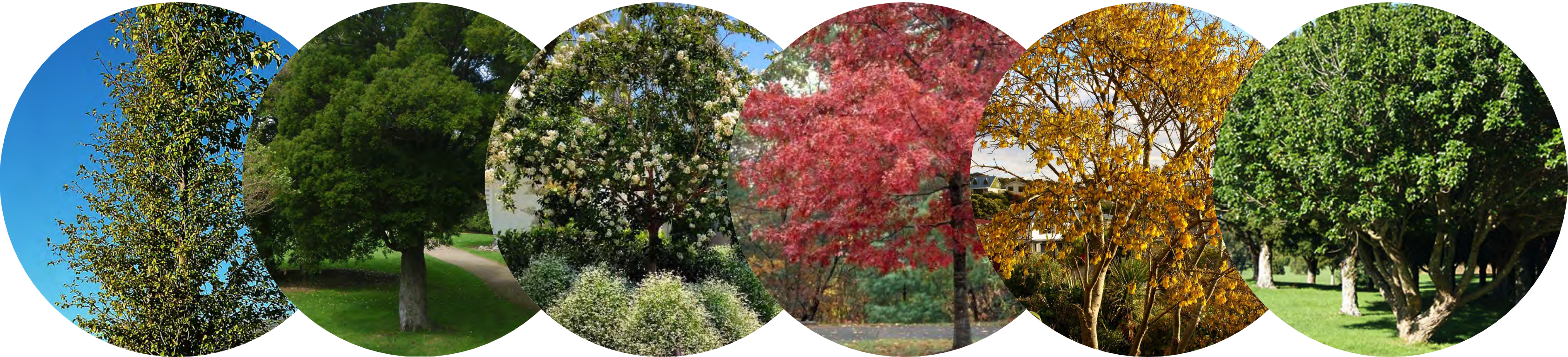
Plagianthus regius Prumnopitys ferruginea Lagerstroemia indica 'Natchez' Quercus rubra Sophora microphylla Vitex lucens