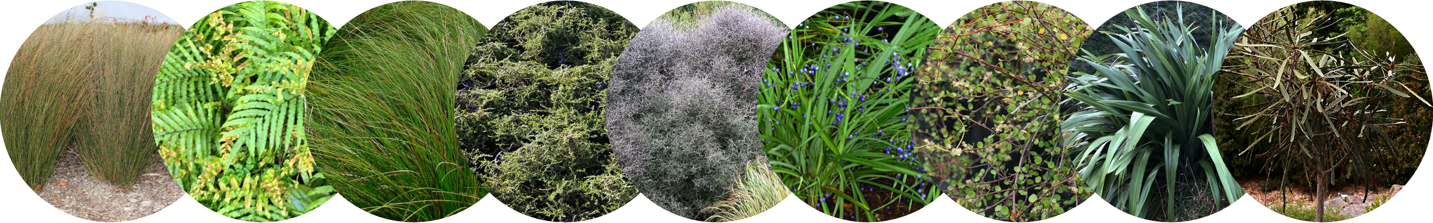
Apodasmia similis Blechnum novae-zelandiae Carex secta Coprosma acerosa Corokia cotoneaster Dianella nigra Muehlenbeckia complexa Phormium cookianum Pseudopanax crassifolius