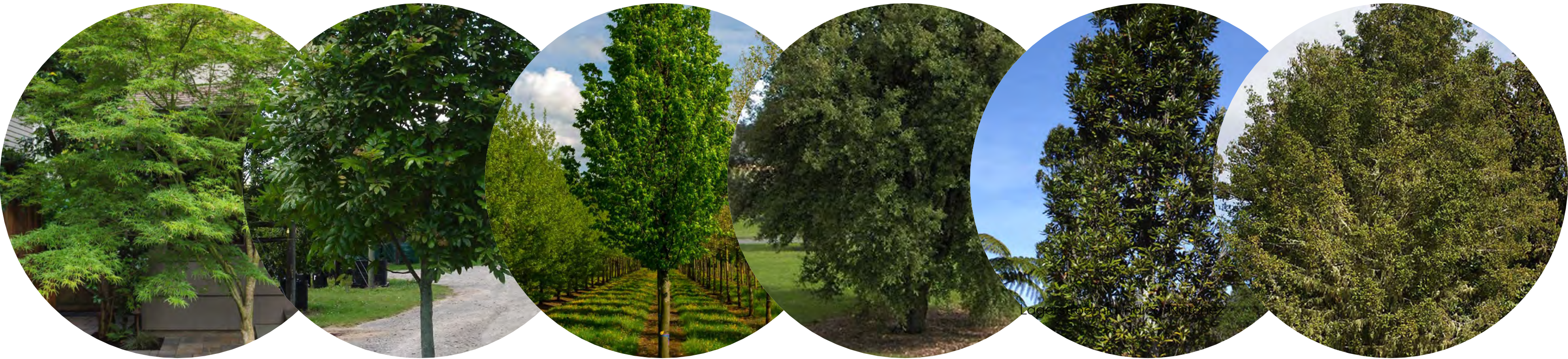
Acer palmatum Alectryon excelsus Carpinus betulus fastigiata Hoheria populnea Knightia excelsa Phyllocladus trichomanoides