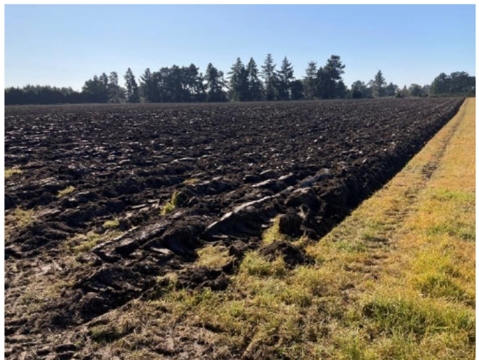
Plate 6 – Freshly cultivated cropland, 173 Pound Road.