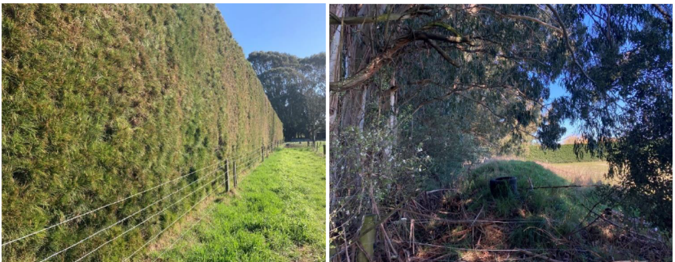
Plate 1 – Exotic shelterbelt forest, box trimmed pines (left), and large uncut eucalyptus trees with subcanopy and understorey present (right).

Exotic shelterbelts are present around much of the study area boundary and some paddock margins. These shelterbelts are mostly formed by densely planted rows of single tree species including pine ( Pinus radiata ), macrocarpa ( Cupressus macrocarpa ), eucalyptus species, Lebanese cypress ( Cedrus libani ) and poplars ( Populus nigra ), (Plate 1). The understorey beneath these shelterbelts varies considerably. Under dense 'box trimmed' pine and macrocarpa trees there is little but bare ground and needle duff, but under large un-trimmed trees there is a subcanopy of shrubs and scattered patches of ground cover vegetation (Plate 1). Subcanopy tree and shrubs include, tree lucerne ( Chamaecytisus palmensis ), elder ( Sambucus nigra ), and cherry ( Prunus species) along with Ivy ( Hedera helix ). While common ground cover species include cocksfoot ( Dactylis glomerata ), couch ( Elytrigia repens ) and hedge mustard ( Sisymbrium officinale ).