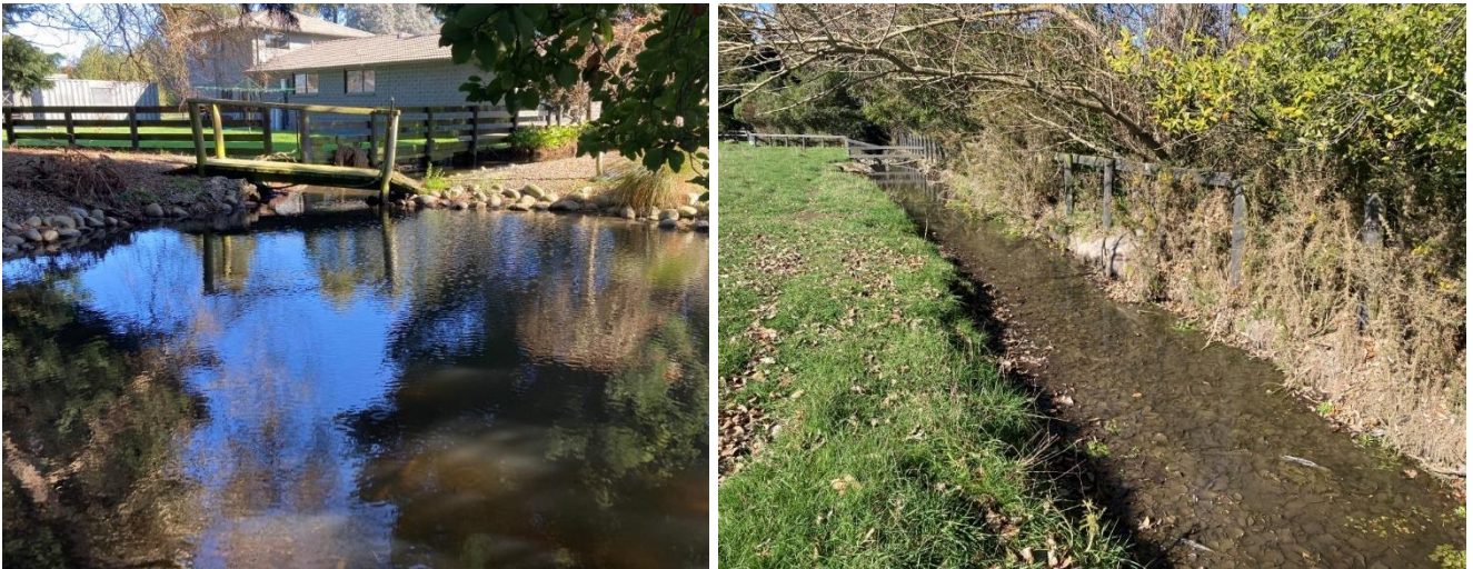
Plate 8 – Ornamental pond (left) and stock water race flowing into site on property at 94 Barthers Road (right).