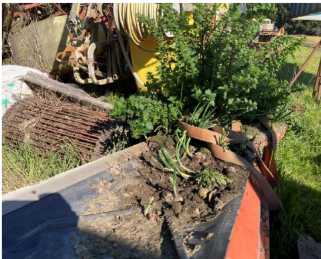
Plate 5 – Farm buildings and debris habitat, with rank grass and weeds growing through old machinery

The property 173 Pound Road (Lot 3 DP 33334), is currently market garden farmland. At the time of the survey most of the property was freshly cultivated cropland, with exotic grass around the margins being the only vegetation present (Plate 6).