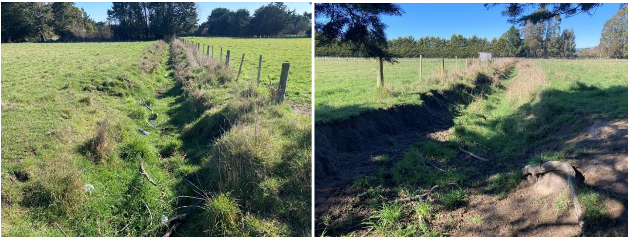
Plate 7 – Dry swale channel cutting through the middle of the property at 86 Barthers Rd.

A Selwyn District Council (SDC) stock water race, which is part of the 'Paparua Water Race scheme' enters the site at 94 Barthers Road and flows north along the boundary of 4 and 14 Hasketts Road 1 before flowing east through the middle of the property at 86 Barthers Rd (Lot 1 DP 38418) and along the southern boundary of 173 Pound Road. The reach within 94 Barthers Road is mapped as 'in service' 2 , and was holding water during site visits (although length of wetted channel varied). The race within this reach has also been incorporated into an ornamental pond and waterway feature (Plate 7). The eastern section of the race (within 86 Barthers Rd and 173 Pound Road) was dry during site visits and appears to be disused (Plate 7). The area of wetted channel (from the pond to the road) was the only section with any aquatic associated vegetation present, this included water forget-me-not ( Myosotis laxa ), blue sweet grass ( Glyceria species), and celery-leaved buttercup ( Ranunculus sceleratus ). Indigenous pūkio ( Carex secta ) and harakeke were also present but most likely planted.