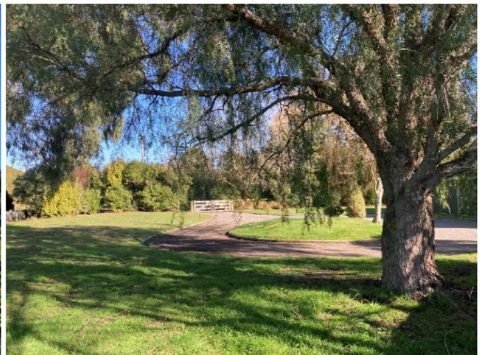
Plate 3 – Ornamental plantings, gardens and dwellings habitat, with mature pepper tree ( Schinus molle ), foreground and indigenous border in background.