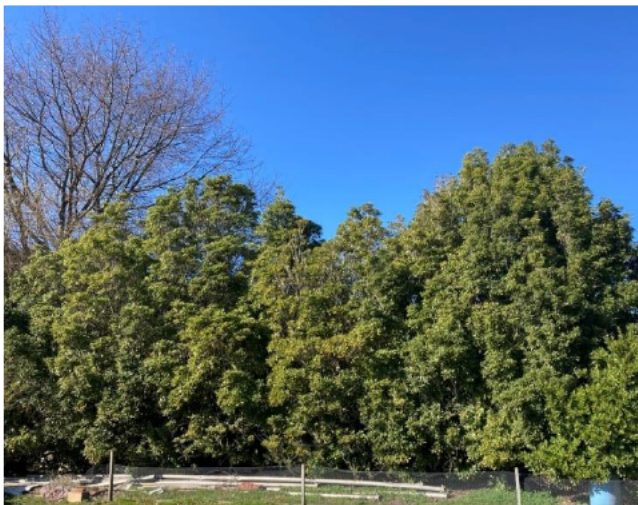
Plate 2 – Indigenous hedgerow forest, with mature tarata/lemonwood trees.

There are five existing dwellings on the study area with associated gardens, ornamental plantings and hedges. These areas were not extensively investigated, but trees and shrubs observed included the exotic species camellia ( Camellia japonica ), rhododendron ( Rhododendron species), ornamental cherry ( Prunus species), silver birch ( Betula pendula ), and olive ( Olea europaea ). These areas were also where the highest diversity of indigenous species is found (although all planted), with trees including tawhairaunui/red beech ( Fuscospora fusca ), puahou/five finger ( Pseudopanax arboreus ), tī kōuka/cabbage tree ( Cordyline australis ), horoeka/lancewood ( Pseudopanax crassifolius ), kāpuka, kohuhu and tarata all common (Plate 3). Other commonly observed indigenous species include korokio ( Corokia cotoneaster ), kakaha ( Astelia fragrans ), karamu ( Coprosma lucida ) and harakeke ( Phormium tenax ). There were also two species with a national threat classification (de Lange et al. , 2018): wind grass ( Anemanthele lessoniana , At Risk – Relict) and hakapiri/Chatham Island akeake ( Olearia traversiorum , Threatened – Nationally Vulnerable).