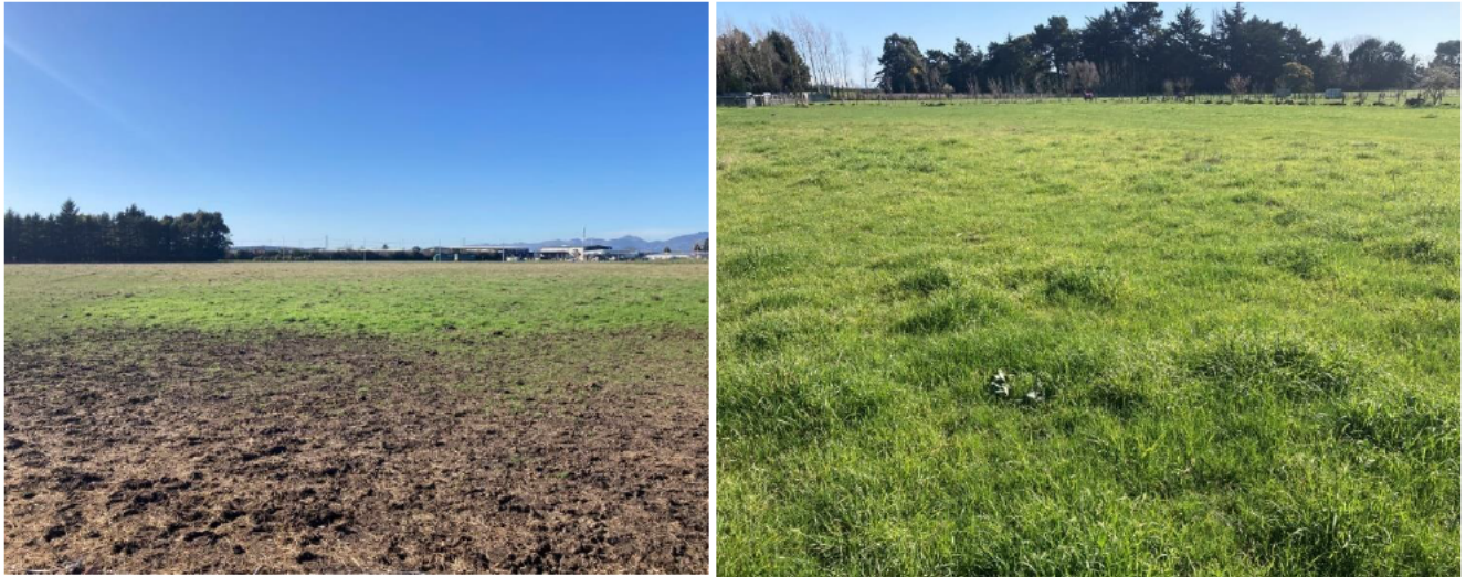
Plate 4 – Cocksfoot pasture grassland, grazed hard with exposed soil (left) and longer ungrazed grass (right).