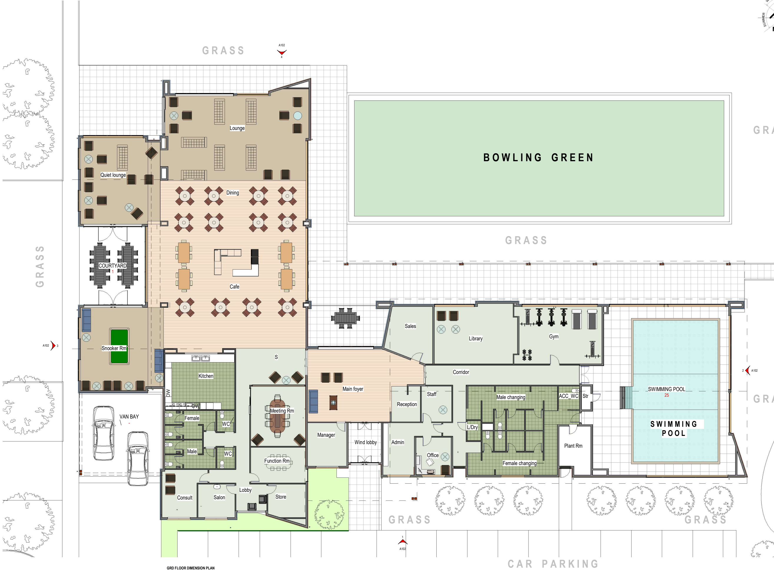
GRID FLOOR DIMENSION PLAN Scale 1:100