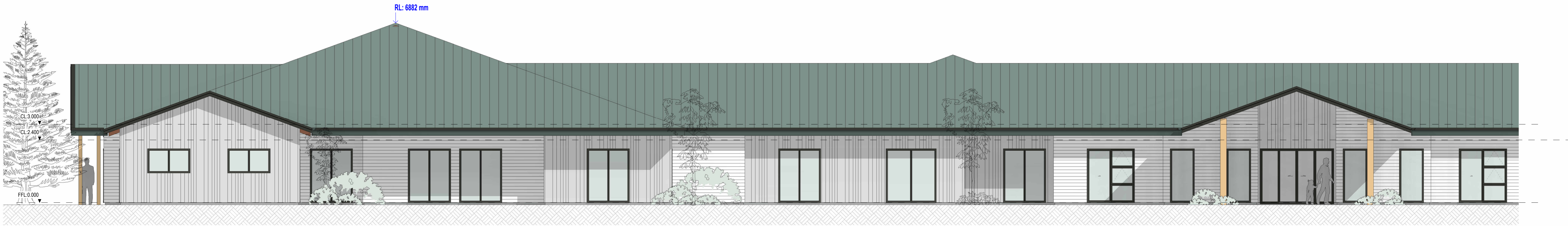
SOUTH ELEVATION (WEST) Scale 1 : 75