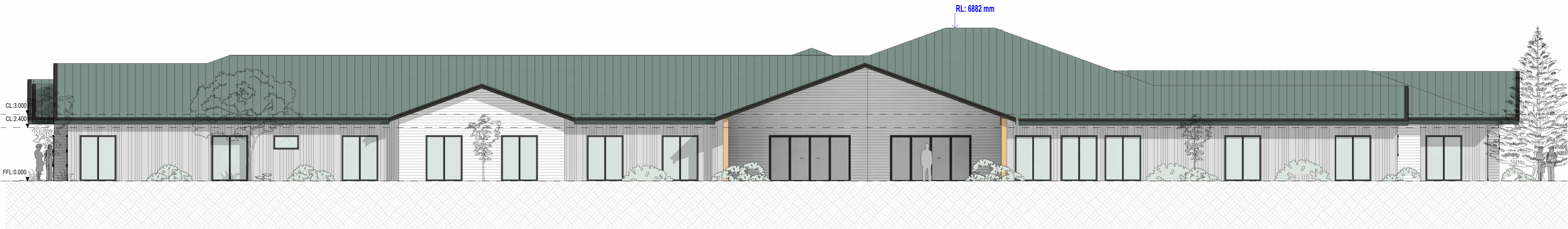
WEST ELEVATION Scale 1 : 100