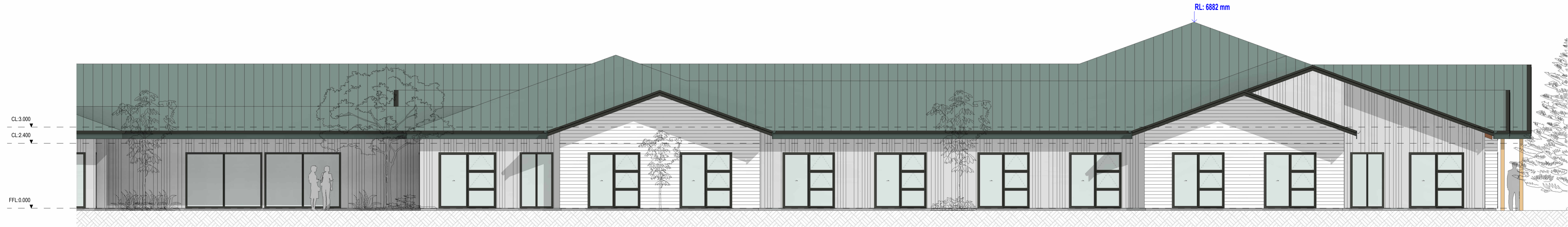
A | NORTH ELEVATION (WEST) A1011 : 75