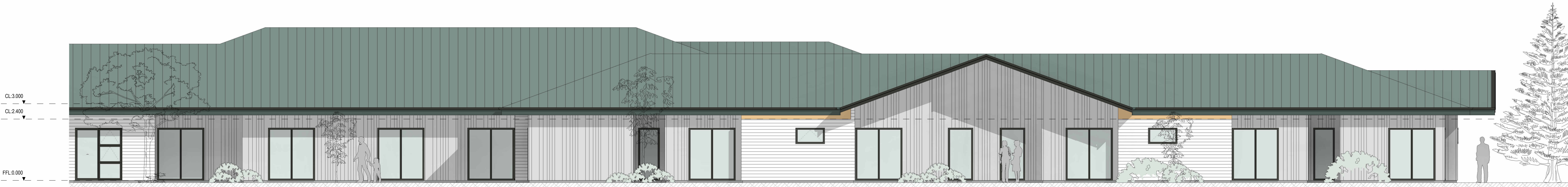
SOUTH ELEVATION (EAST) Scale 1 : 75