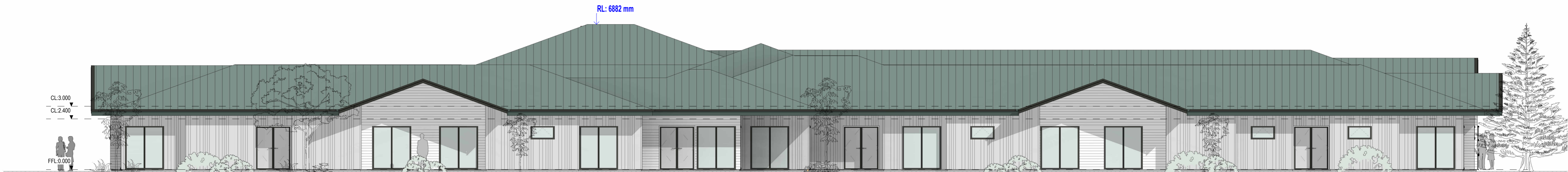
EAST ELEVATION Scale 1 : 100