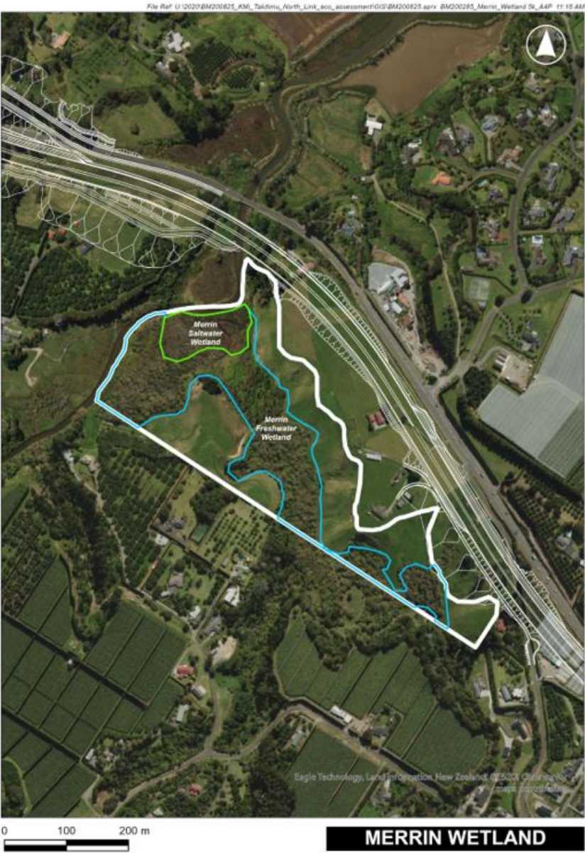
Indicative extent of Merrin Wetland restoration (white outline), freshwater wetland (blue outline/fill), saltmarsh wetland (green outline/fill).