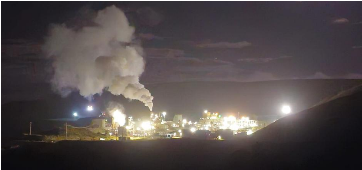
Figure 2: Photograph of Macraes Mine, dated Saturday 7 March, 10.53pm.

the aurora australis which I consider to be a significant adverse effect in relation to this dimension of perceptual landscape values, in the context of a landscape that is valued for its dark night sky values.