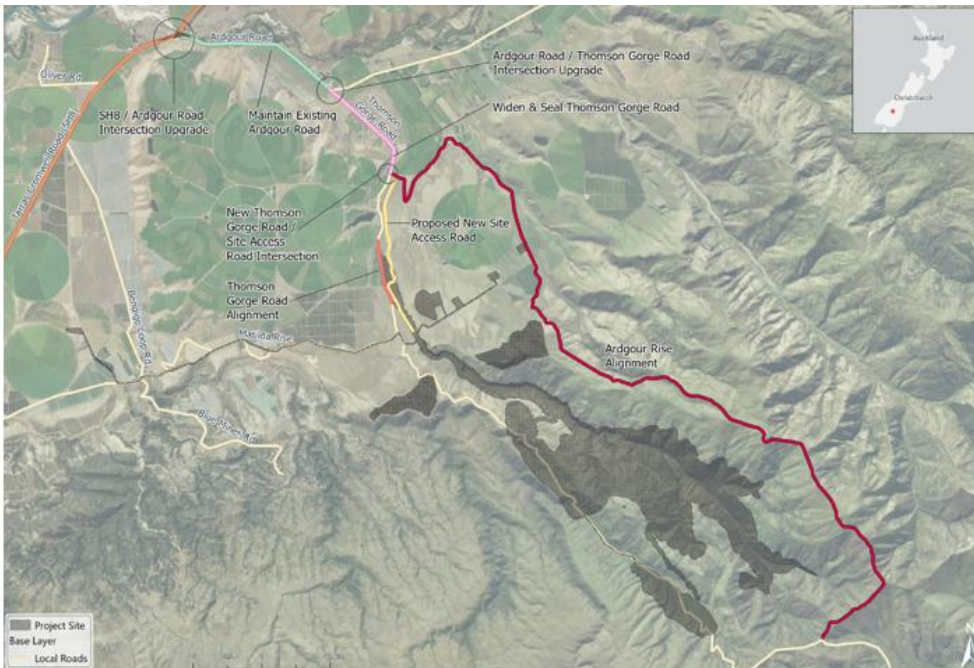
Figure 3-31: Proposed Access Route to the Project Site