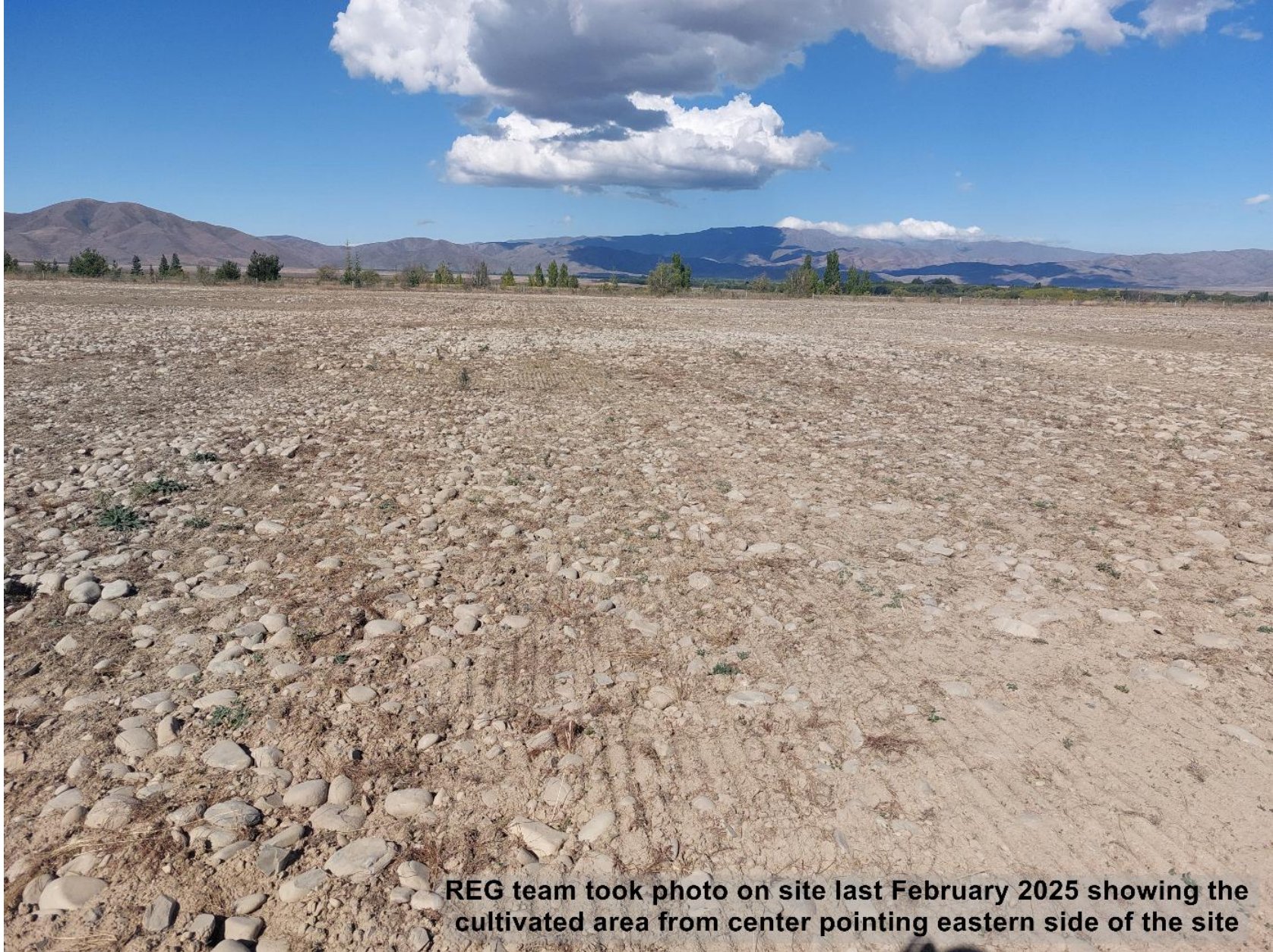
REG team took photo on site last February 2025 showing the cultivated area from center pointing eastern side of the site