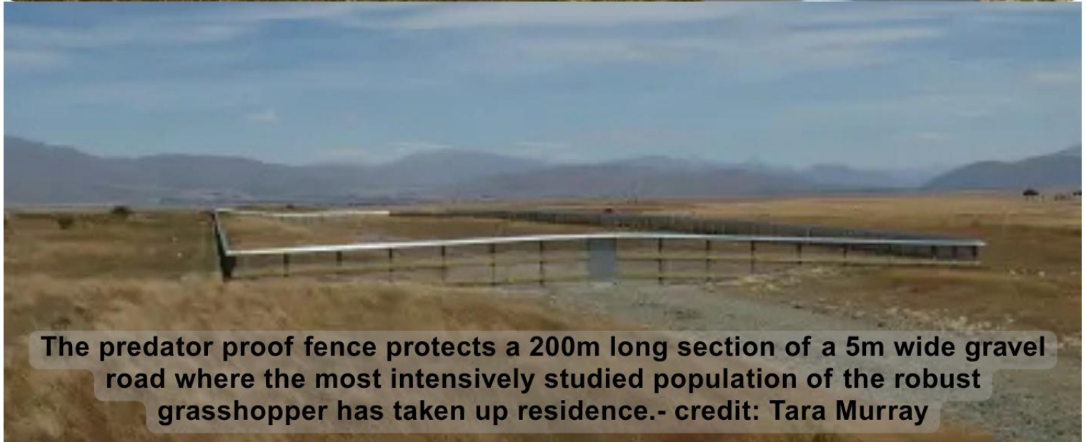
The predator proof fence protects a 200m long section of a 5m wide gravel road where the most intensively studied population of the robust grasshopper has taken up residence.