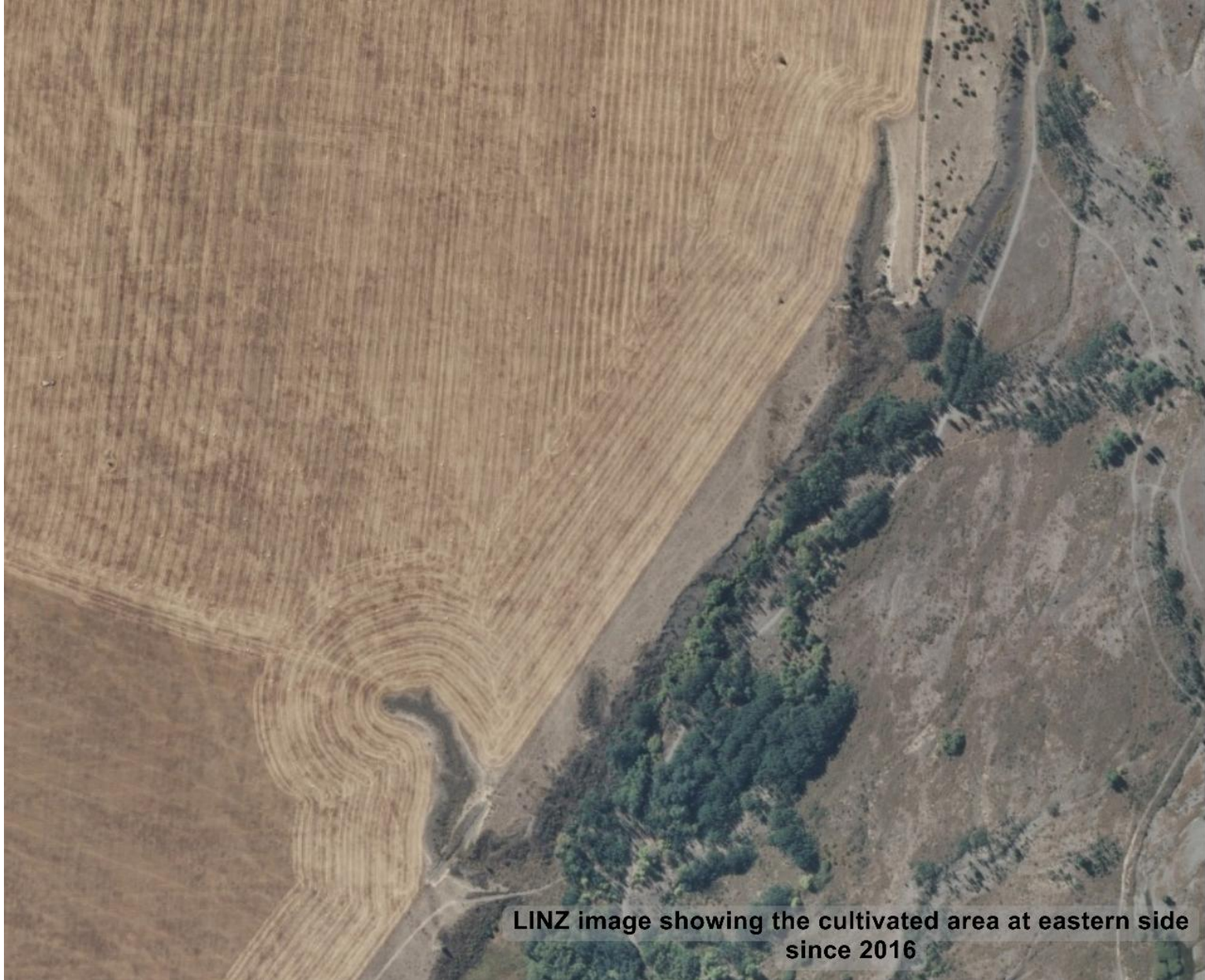
LINZ image showing the cultivated area at eastern side since 2016