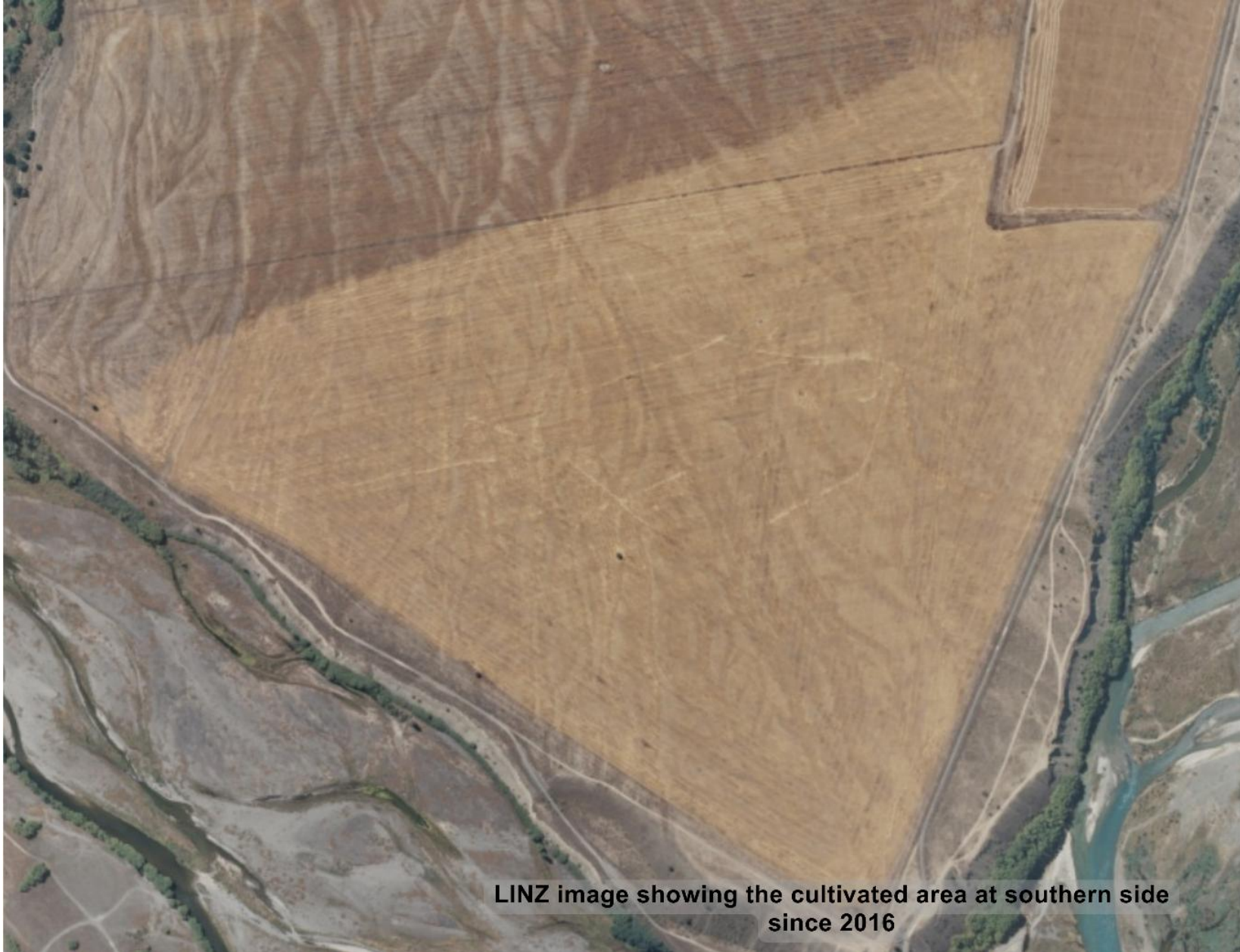
LINZ image showing the cultivated area at southern side since 2016