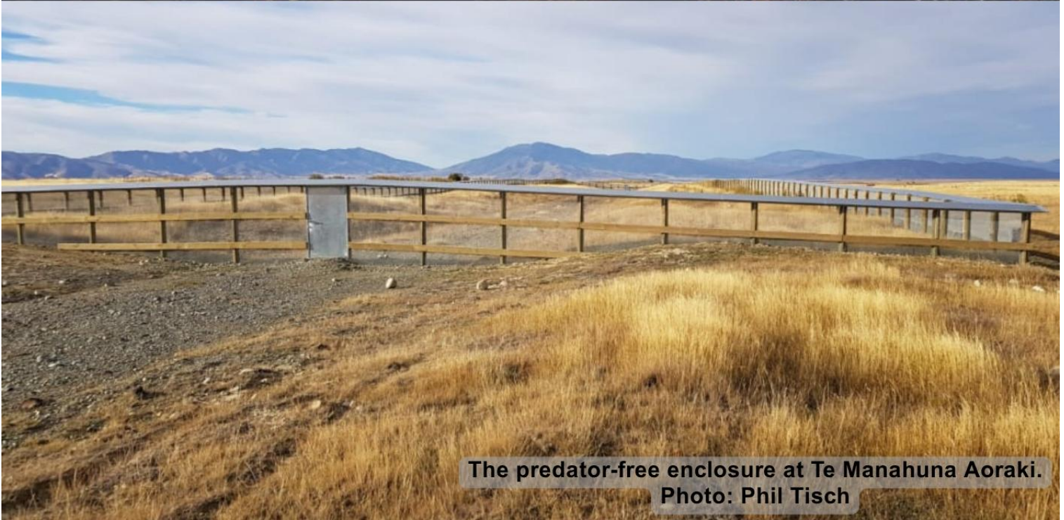
The predator-free enclosure at Te Manahuna Aoraki.