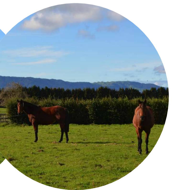
Within Site viewing West