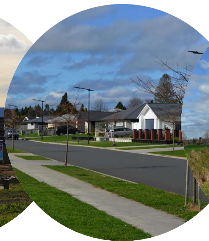
Neighbouring Residential Development