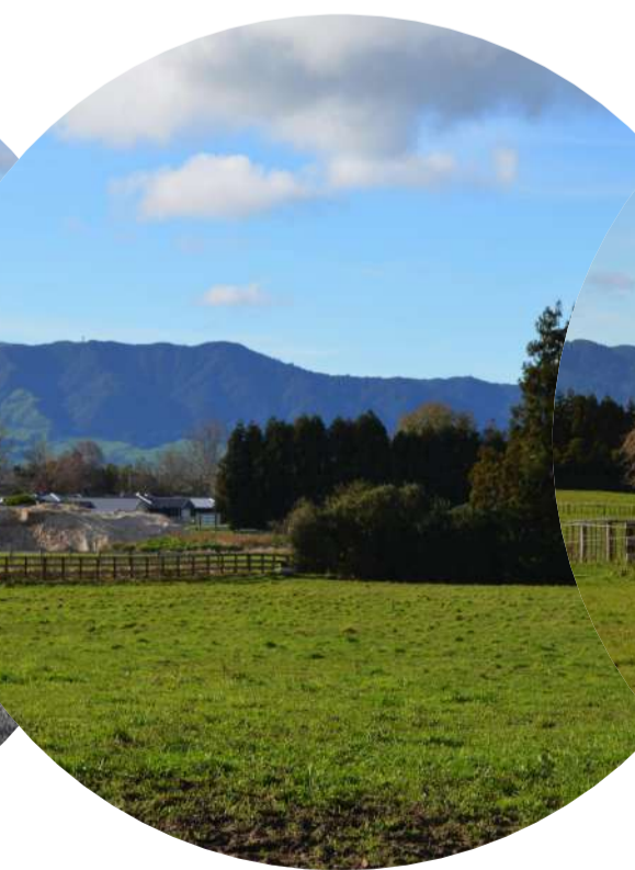
Within Site viewing East