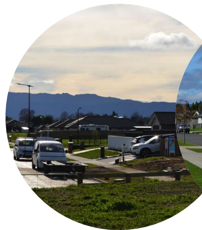
Neighbouring Residential Development