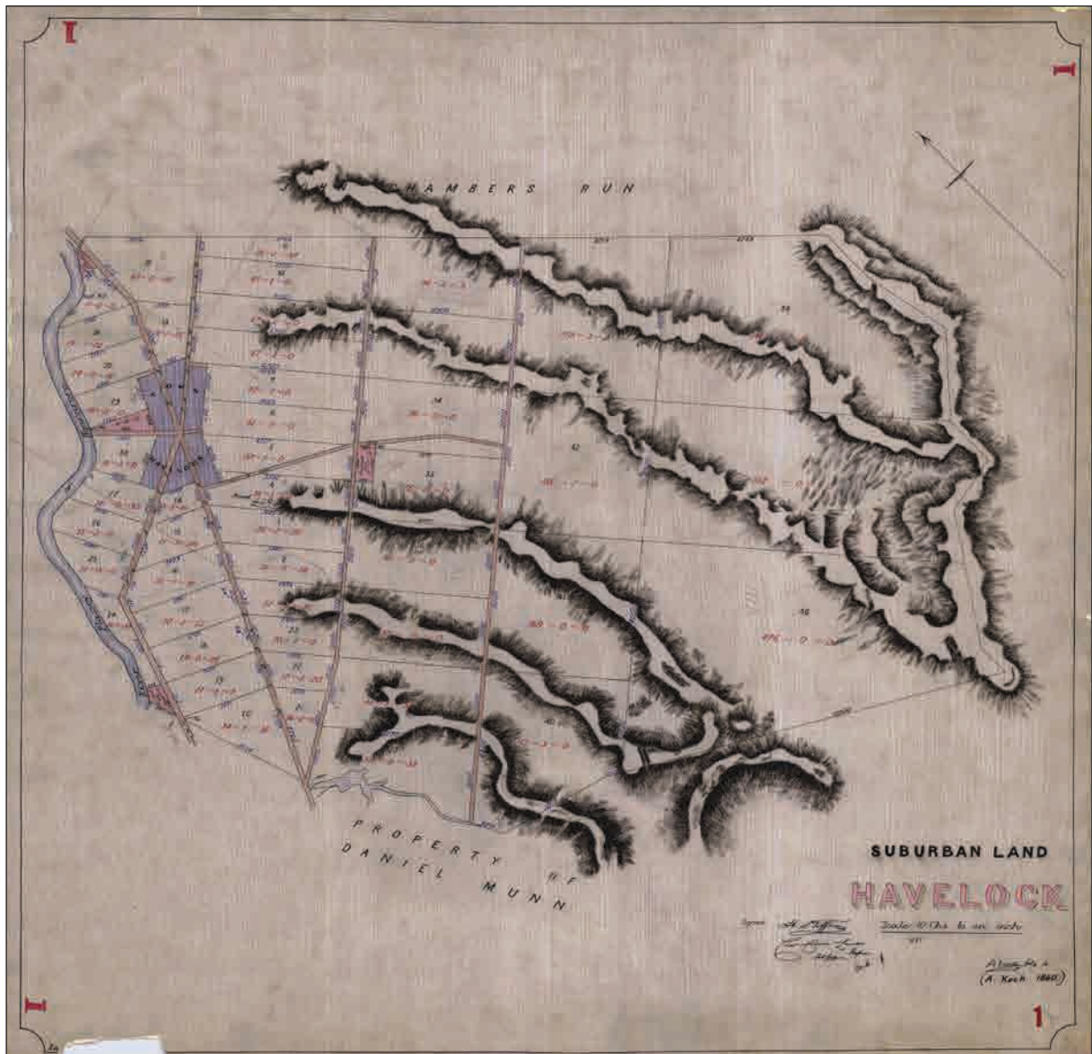
Figure 3. Suburban Land, Havelock, surveyed in 1860 by Henry Tiffen (SO 1).

In 1996 Victoria Grouden excavated site V12/173 at Durham Drive, 3.5 km east of Middle Road, on the lower slopes of Te Mata Peak when a house and driveway were constructed. The site consists of three terraces containing several pits, with some smaller terraces nearby. Her excavations defined a living / working floor on a terrace, with 25 features consisting mostly of groups of stone material, including fire-cracked rock that would have been used for cooking and areas of flaked stone, mostly local chert but including a pakohe (argillite) adze and a partly worked block of pounamu. A small midden contained shell from a variety of environments – beach, estuary and rocky shores – and some rat, bird and fish bone, although the bird and fish was quite fragmentary and was not further analysed. The site was dated to the mid to late 15th century.