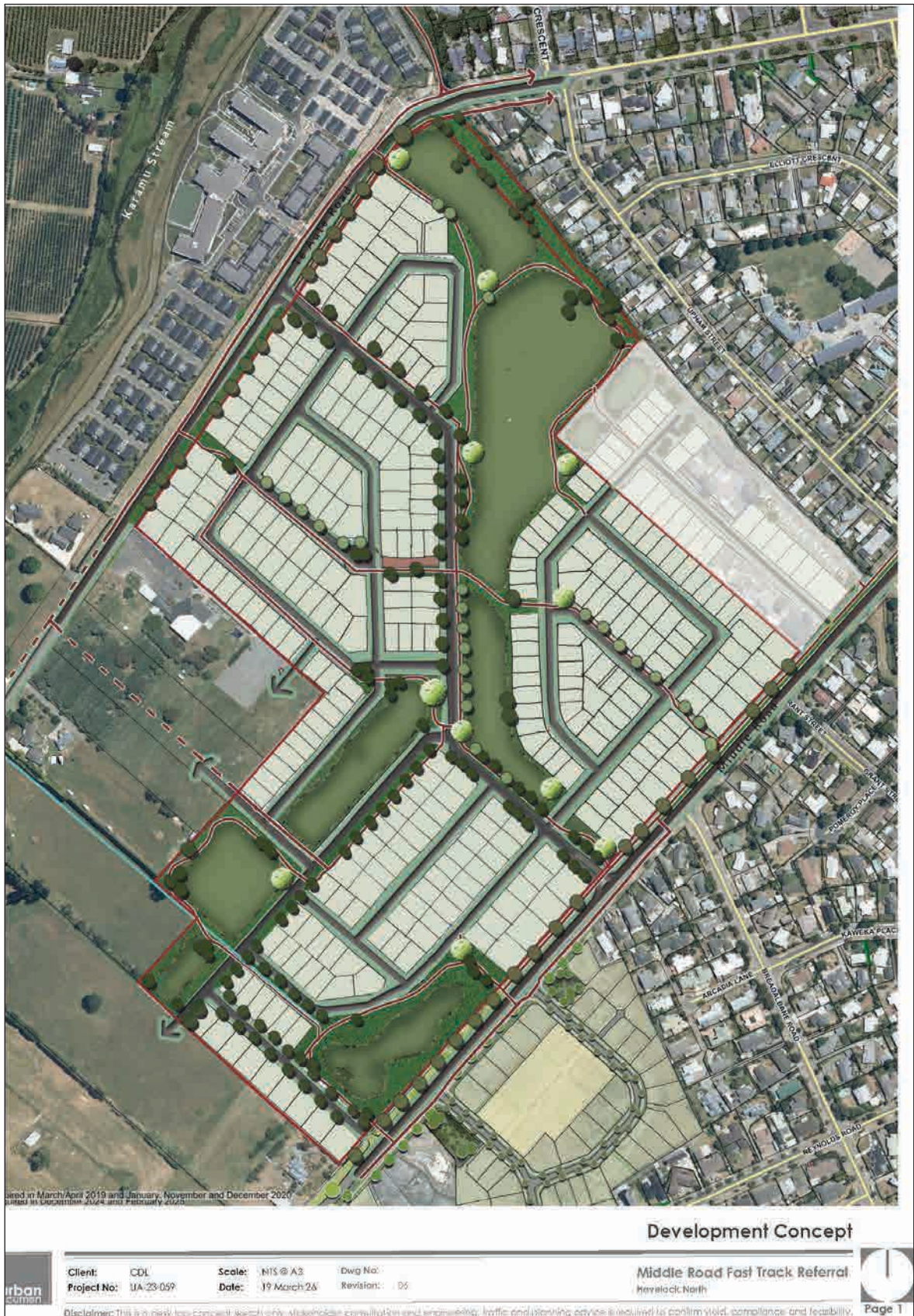
Figure 5. Middle Road Masterplan, 19 March 2026.