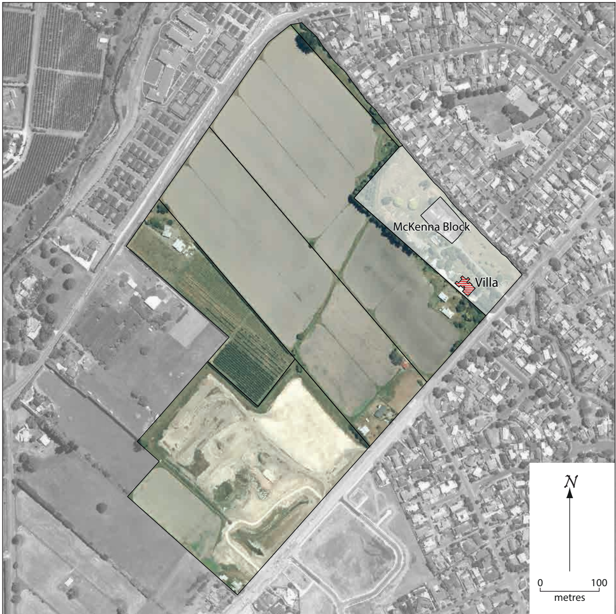
Figure 4. Location of the potential 19th century villa to be retained.