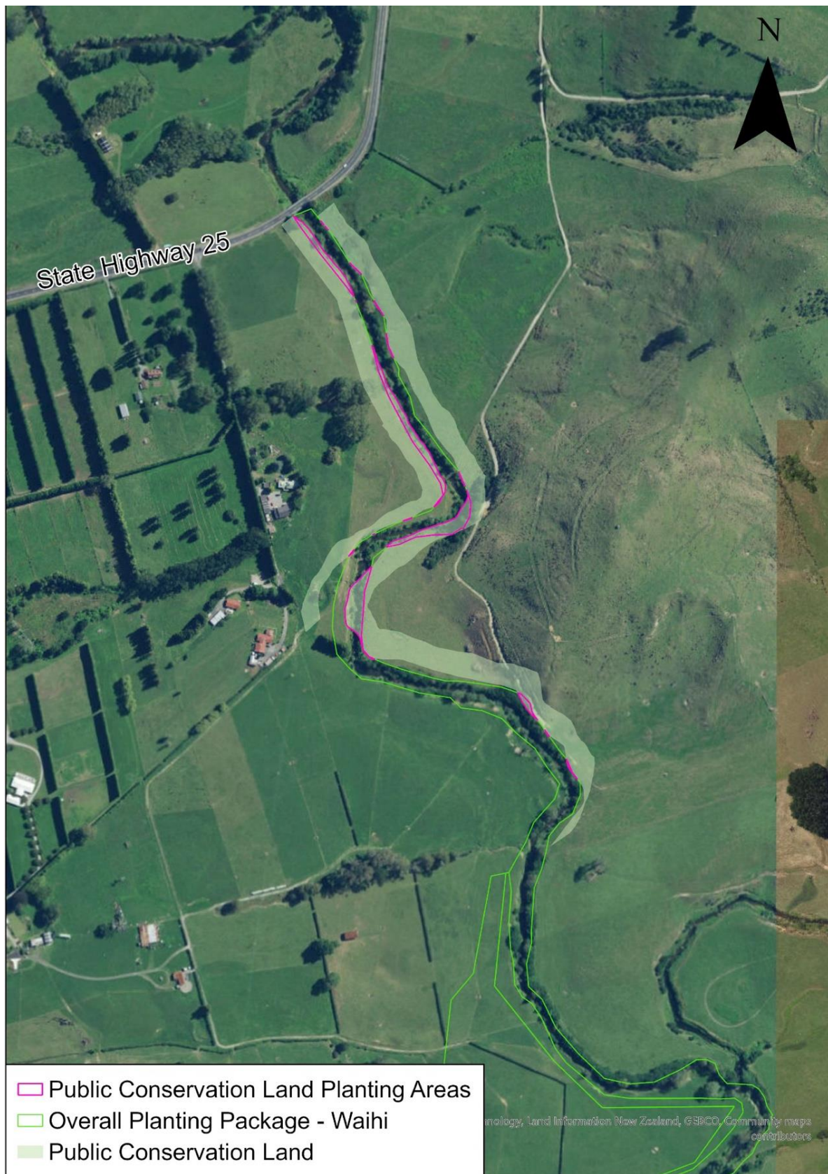
Figure 2: Access Arrangement Area (shown in pink), Marginal Strip - Ohinemuri River