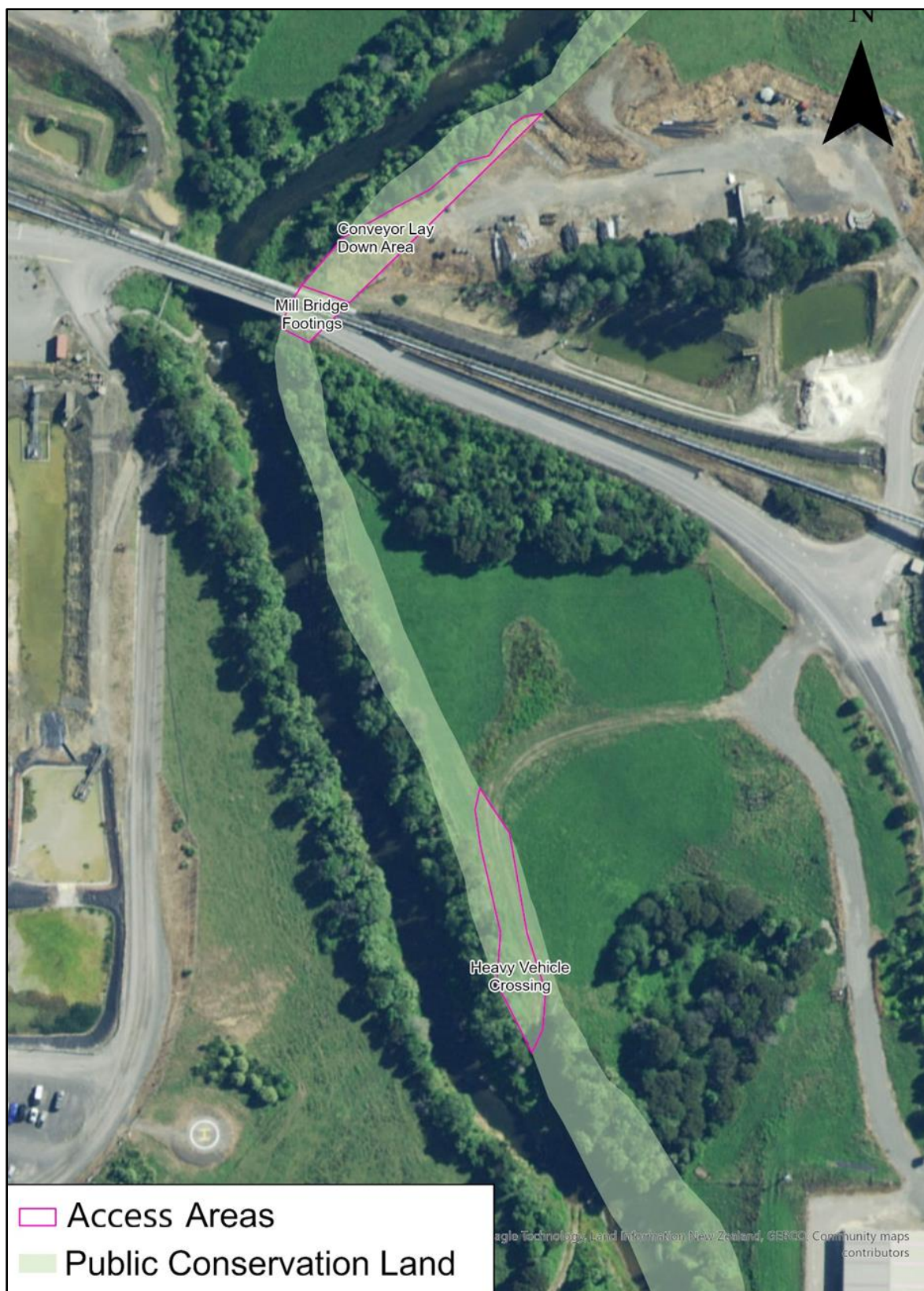
Figure 4: Access Arrangement Area (shown in pink), Marginal Strip - Ohinemuri River