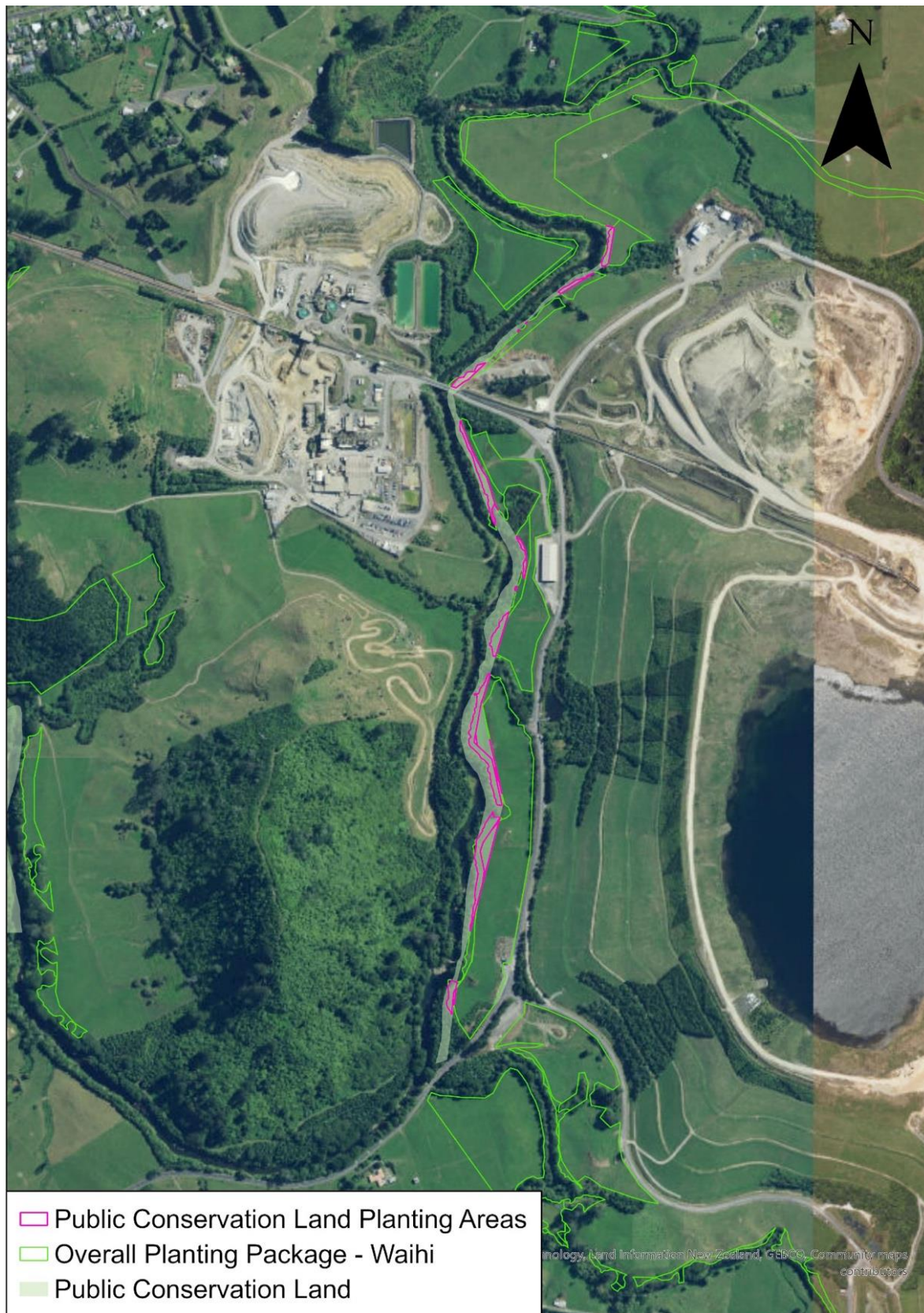
Figure 3: Access Arrangement Area (shown in pink), Marginal Strip - Ohinemuri River