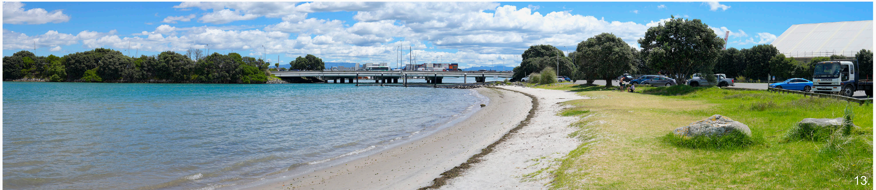
Looking from Whareroa Marae next to Waipu Bay towards Stella Passage (above) & looking from the boundary of Whareroa Marae and the adjoining boat ramp car park towards Stella Passage (below)