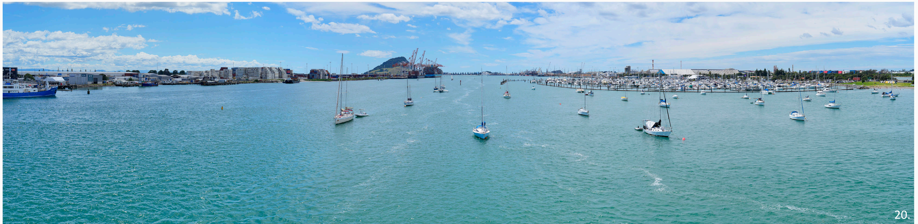
Looking towards Stella Passage and Sulphur Point from the beach at the southern end of the Tauranga Bridge Marina (above) and from the centre of the Harbour Bridge (below)