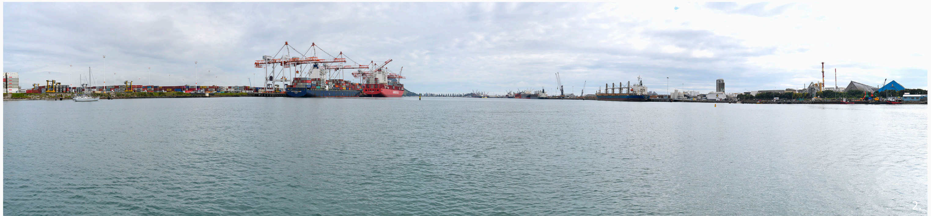
Looking down Stella Passage from near the Tauranga Harbour Bridge Marina (above) & from near Whareroa Bridge (below)