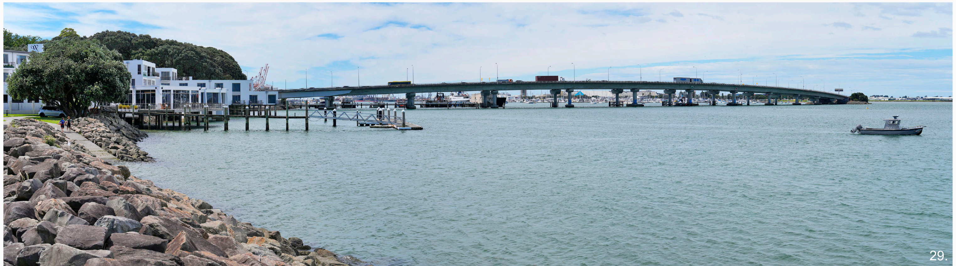
Looking towards Stella Passage and the existing port from the Otamataha Pa & Mission Cemetery (above) and from Dive Crescent, Tauranga (below)