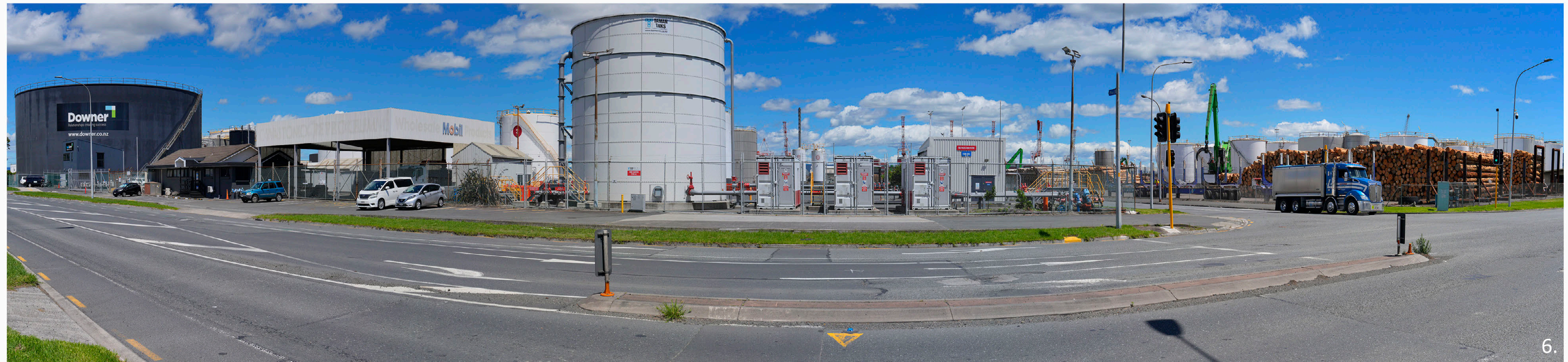
Looking towards the existing port and Stella Passage from Totara Avenue outside the Dominion Salt premises (above) & from Waimarie Street (below)