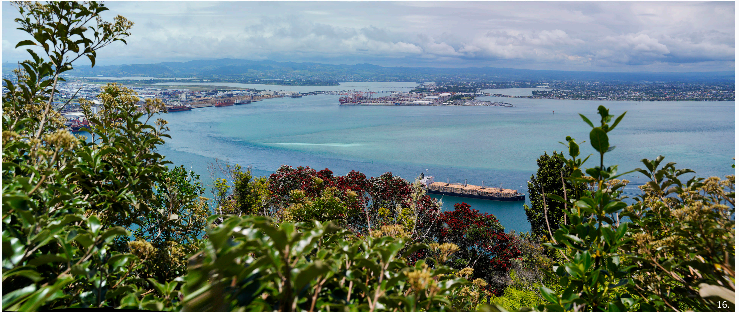
Looking towards the existing port and Stella Passage from Mauao's southern lookout