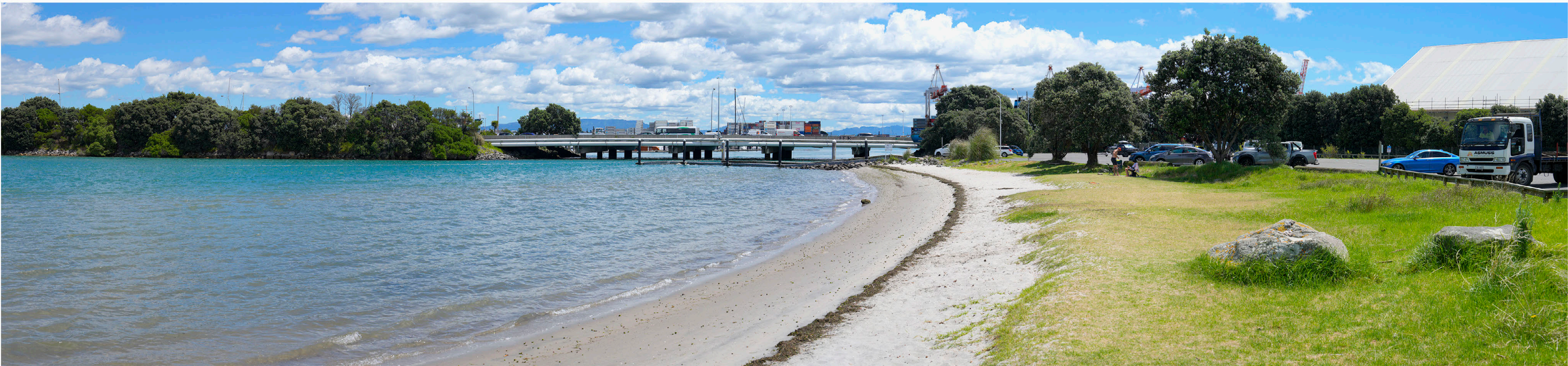
Panorama taken on 31/01/24 at 12.15pm, comprising 4 photos taken with a Sony A7rV full-frame camera 50mm lens. Image shows additional berthage, 110m high A-frame cranes (existing) and shipping extending 286m south of the current berths at Sulphur Point.