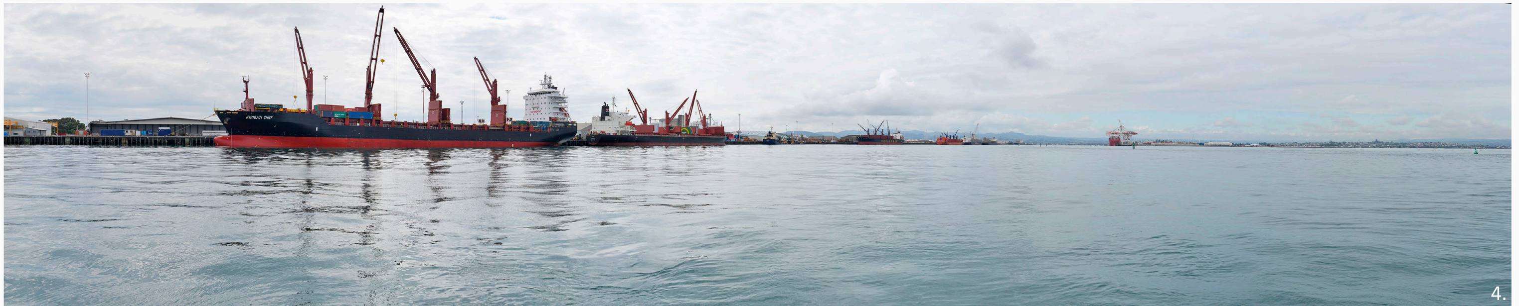
Looking towards the mouth of Stella Passage and Sulphur Point from next to the log port (above) & down the Maunganui Roads towards Stella Passage from near the PoTL offices on Salisbury Avenue (below)