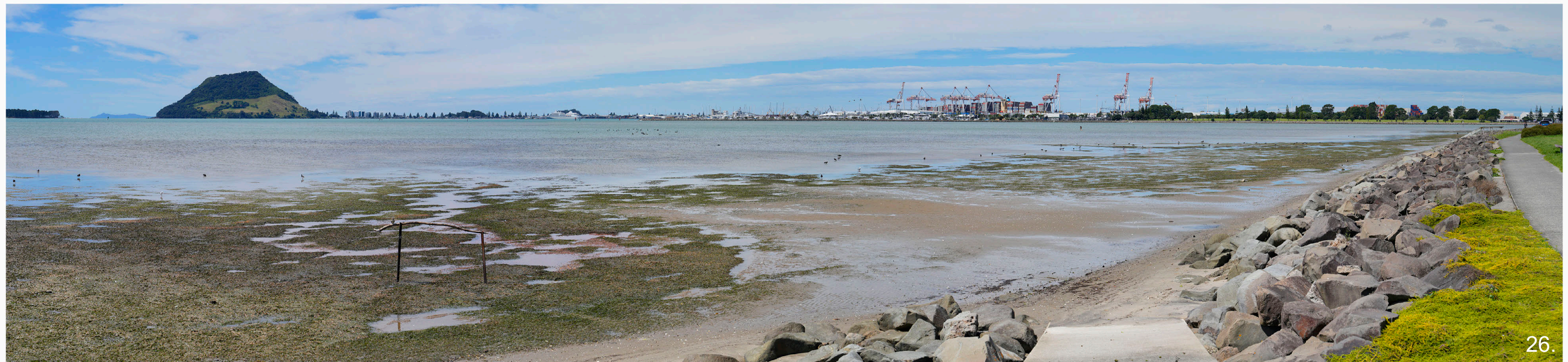
Looking towards the Maunganui Berths and Maunganui Roads from the beach next to the Tauranga Marina (above) and from Otūmoetai Beach (below)