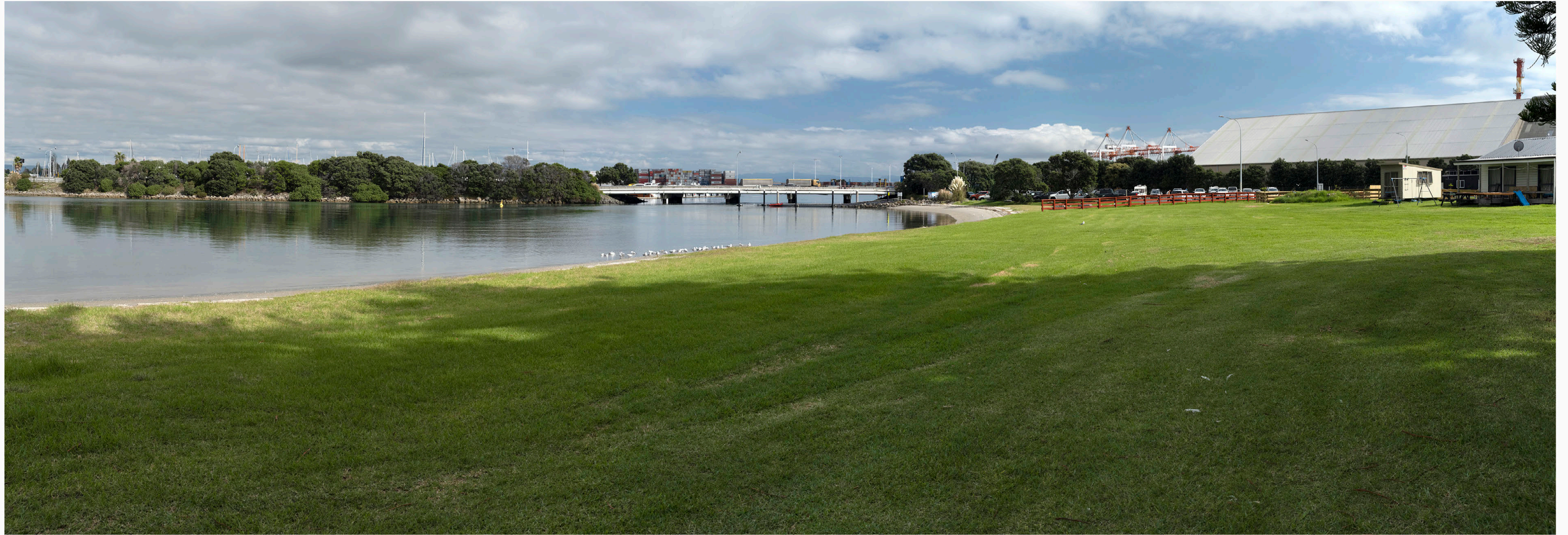
Present-day view from Whareroa Marae next to Waipu Bay: panorama taken on 02/04/22 at approximately 10.10am, comprising 3 photos taken with a Fujifilm GFX 100s medium format camera and a 64mm (50mm equivalent) lens.