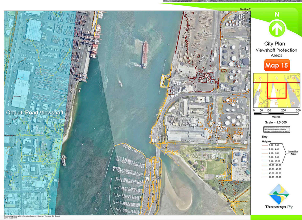
The Ohauiti Road Viewshaft highlighted in light blue (left) & the current view from Ohauiti Road towards Mauao