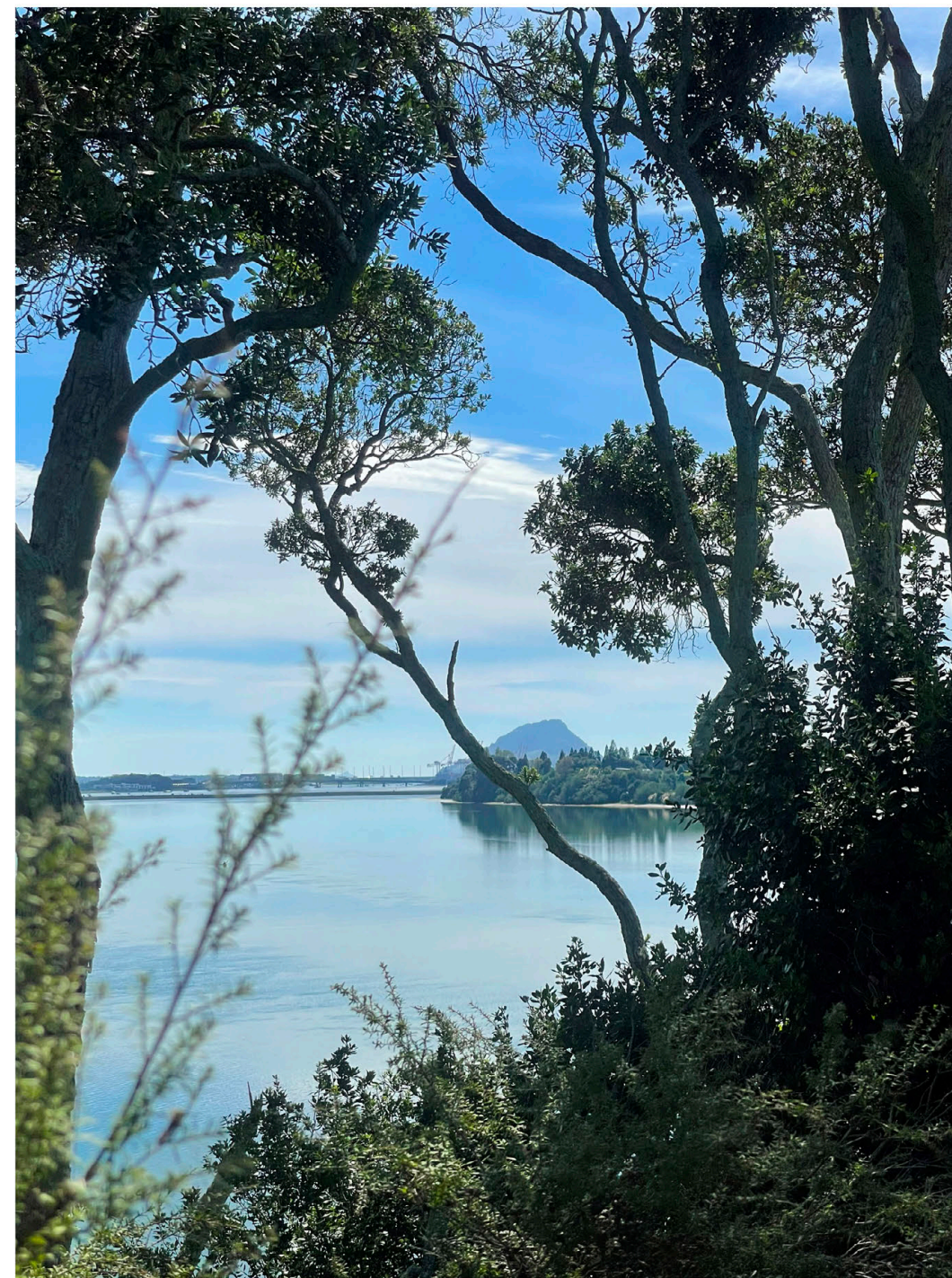
Partial views towards Mauao from Ariki Park (rugby & sports club grounds) above Maungatapu Marae on Maungatapu Road