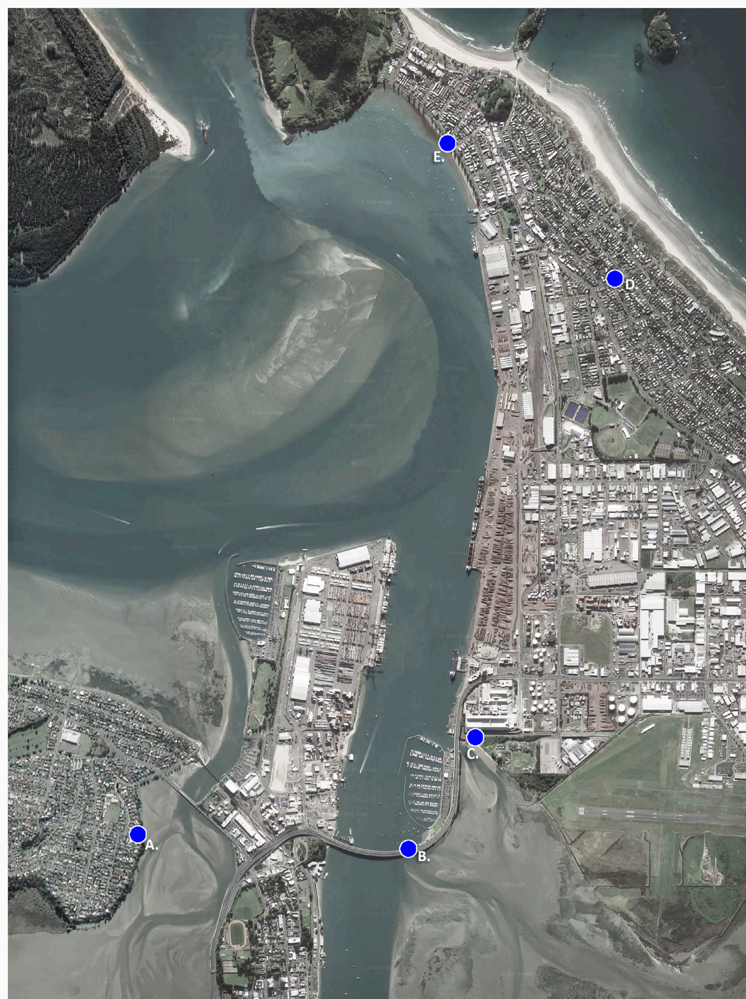
● Photopoints A-E