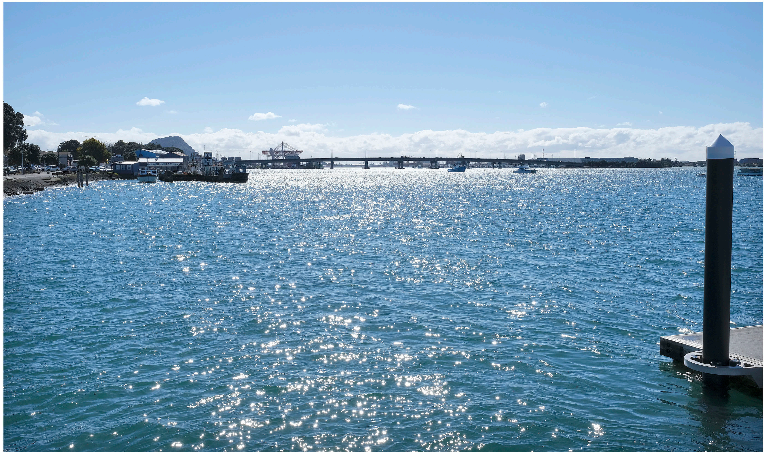
Photo taken on 30/09/2019 at 3.14pm, with a Fuji XT3 camera and 50mm (equivalent) lens