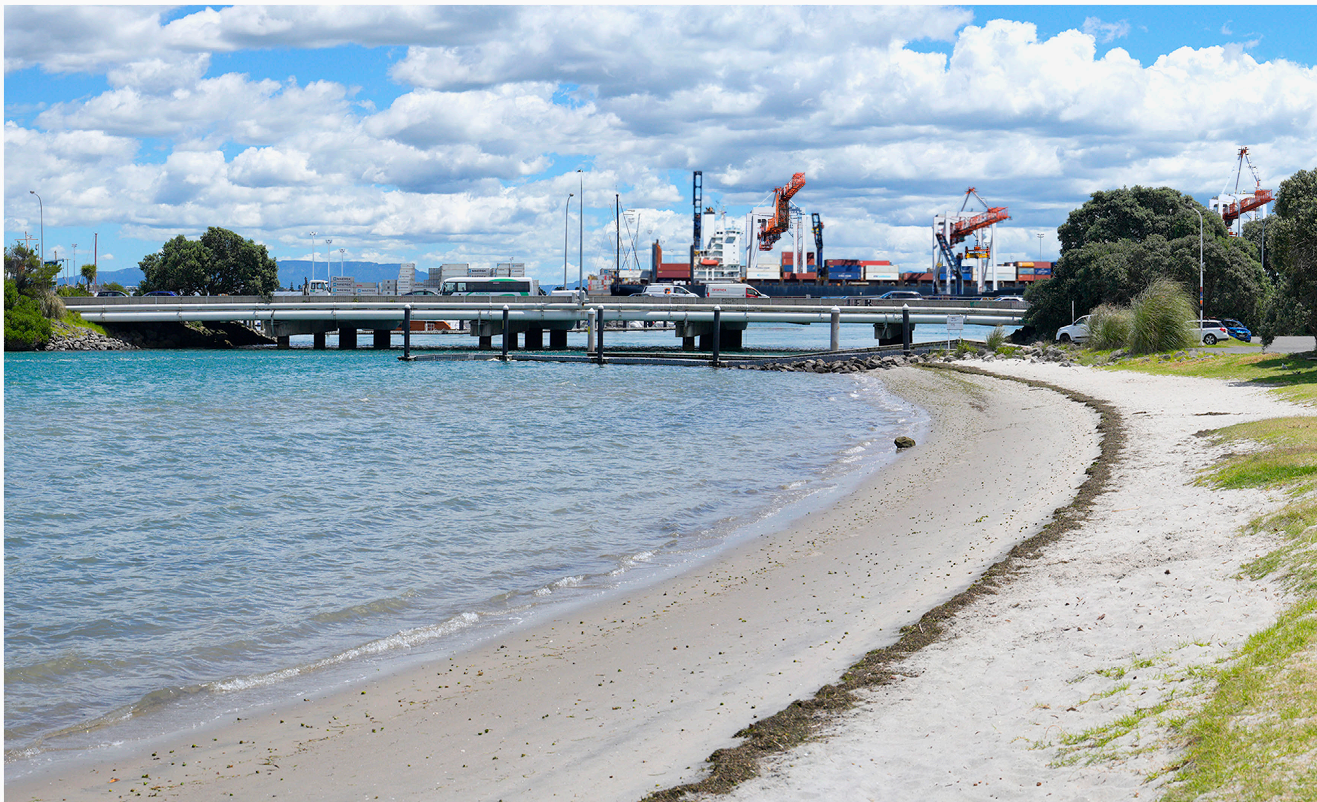
Single-frame photo taken on 31/01/24 at 12.15pm with a Sony A7rV full-frame camera and 50mm lens. Image shows an additional container ship berth, 78m high articulated boom cranes and 110m high A-frame crane, and shipping extending 385m south of the current berths at Sulphur Point.