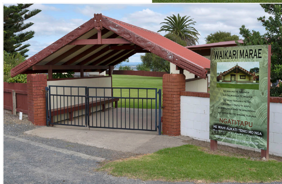
View from next to Waikari Marae over the Matapihi Peninsula towards Mauao