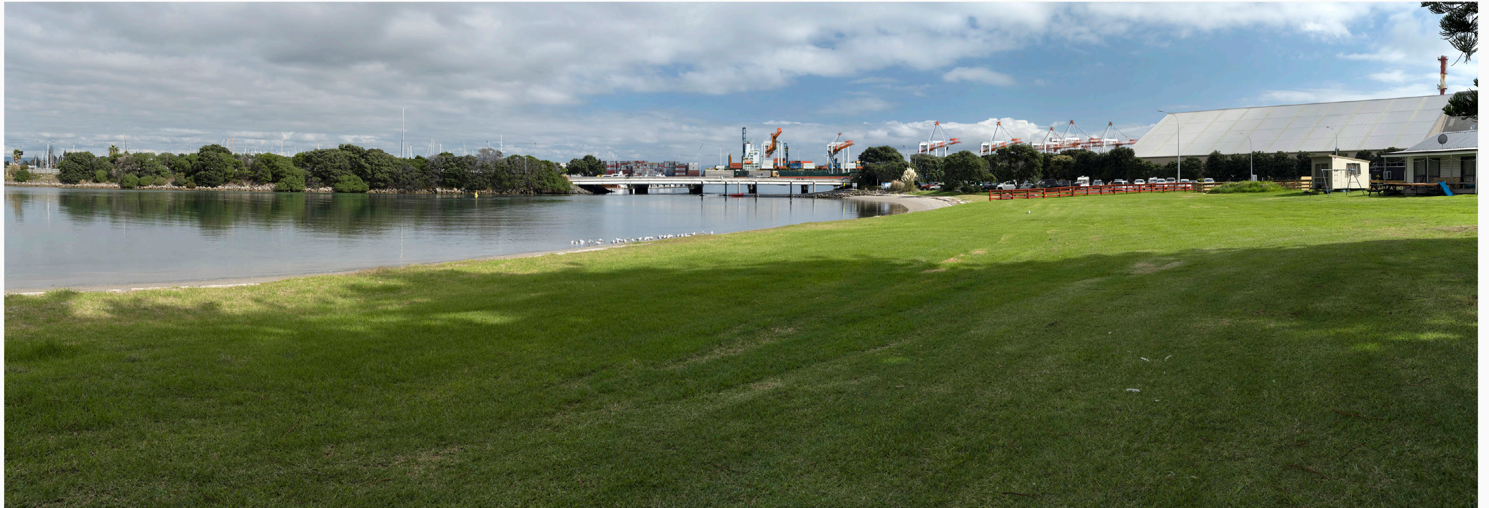
Panorama taken on 02/04/22 at approximately 10.10am, comprising 3 photos taken with a Fujifilm GFX 100s medium format camera and a 64mm (50mm equivalent) lens. Image shows additional berths, 78m high articulated boom cranes and 110m high A-frame cranes, and shipping extending 385m south of the current berths at Sulphur Point.