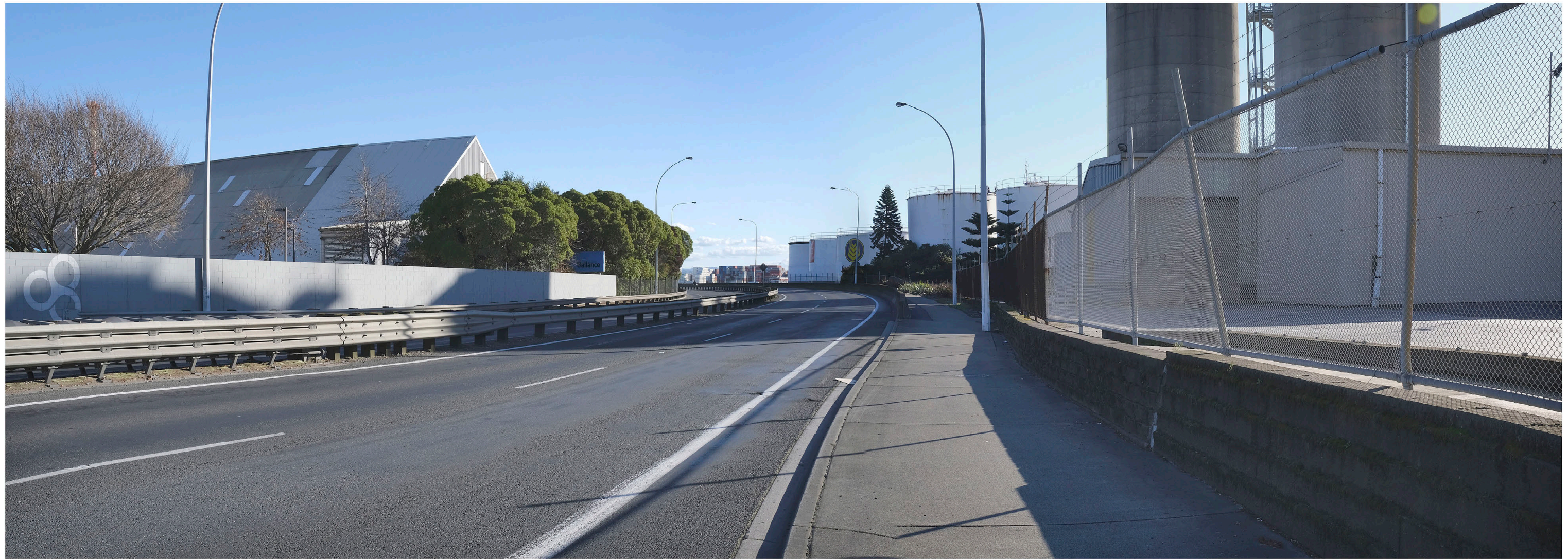
Panorama taken on 30/09/2019 at 1.43pm, comprising two photos taken with a Fuji XT3 camera and 50mm (equivalent) lens