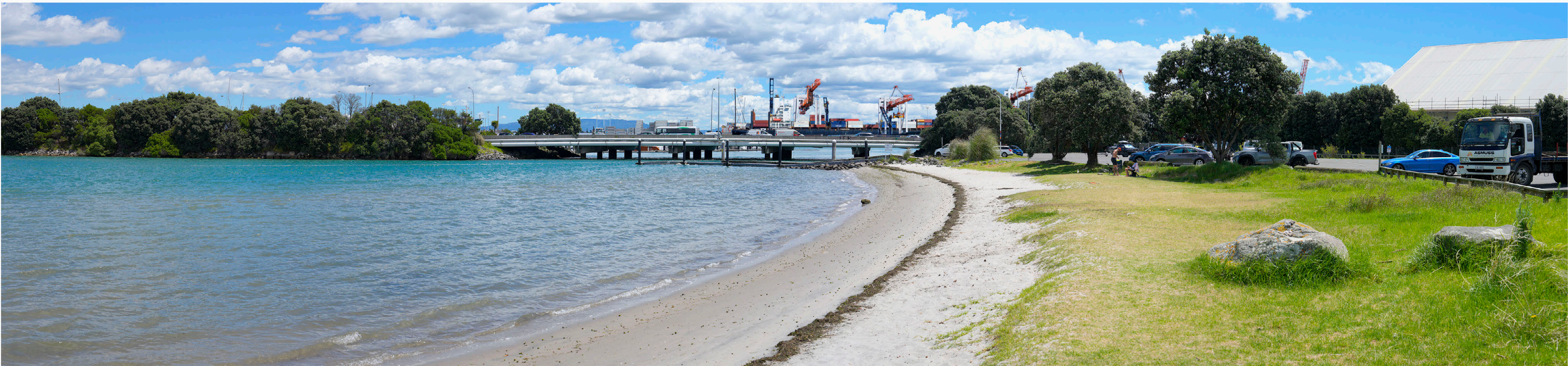
Panorama taken on 31/01/24 at 12.15pm, comprising 4 photos taken with a Sony A7rV full-frame camera 50mm lens. Image shows additional berths, 78m high articulated boom cranes and 110m high A-frame cranes, and shipping extending 385m south of the current berths at Sulphur Point.