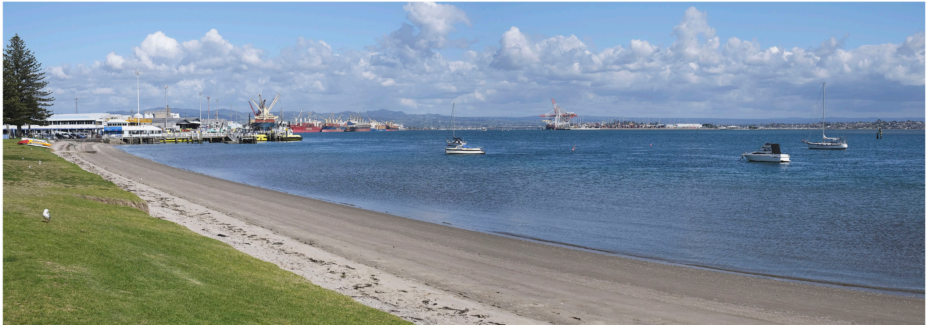
Panorama taken on 30/09/2019 at 1.43pm, comprising two photos taken with a Fuji XT3 camera and 50mm (equivalent) lens