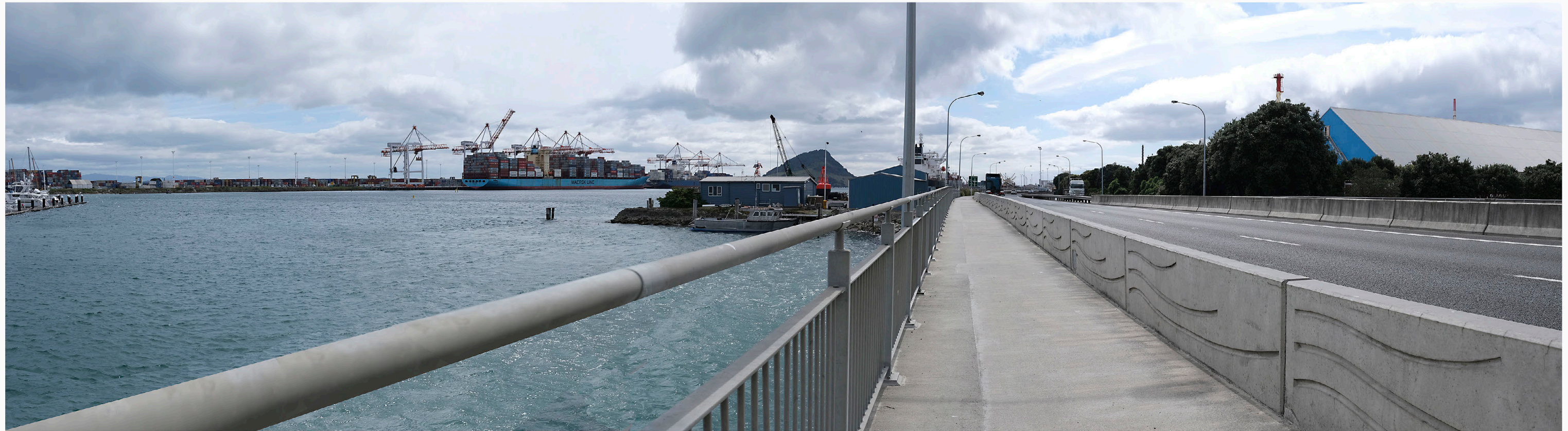
Panorama taken on 30/09/2019 at 2.55pm, comprising 3 photos taken with a Fuji XT3 camera and 50mm (equivalent) lens