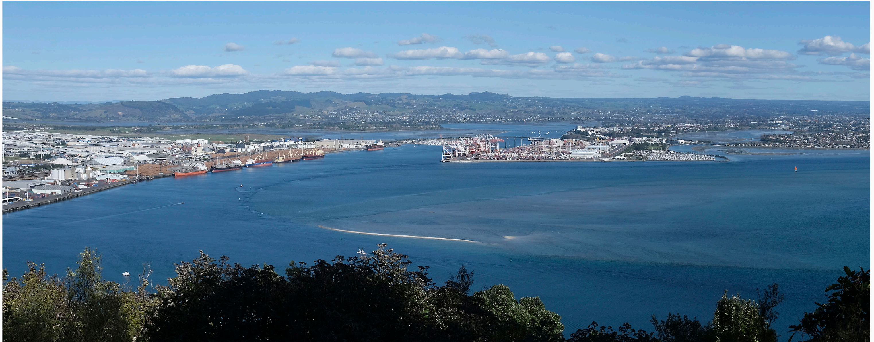
Panorama taken on 30/09/2019 at 12.21pm, comprising two photos taken with a Fuji XT3 camera and 50mm (equivalent) lens