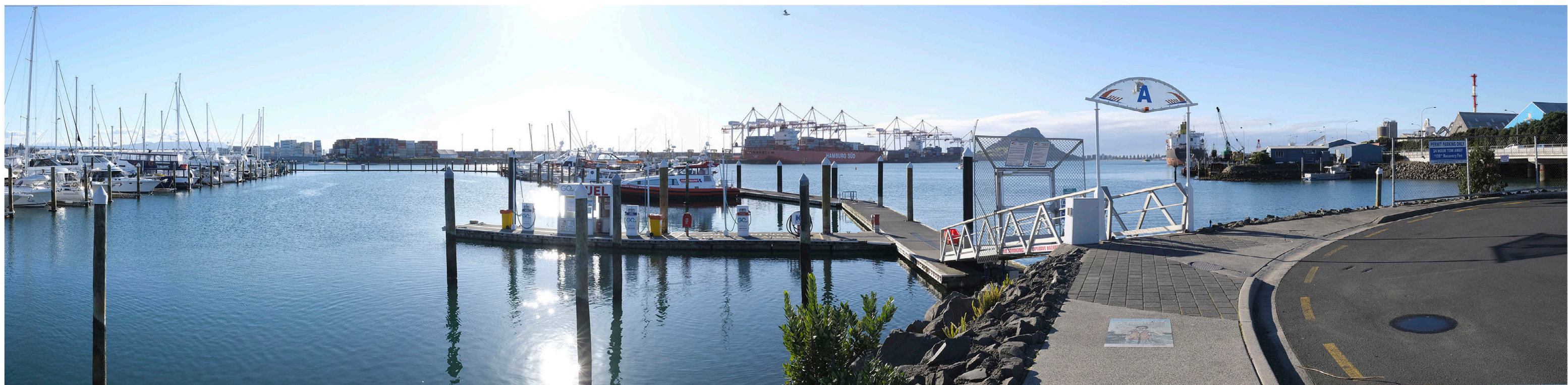
Panorama taken on 30/09/2019 at 2.57pm, comprising 3 photos taken with a Fuji XT3 camera and 50mm (equivalent) lens