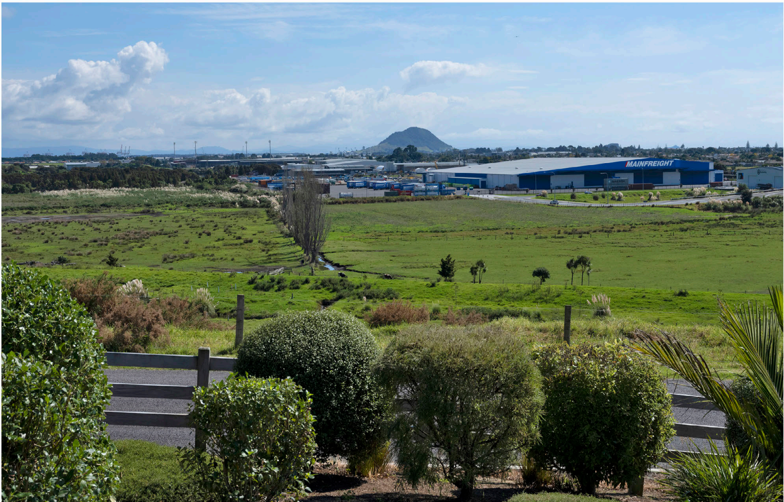
View from the Mangatawa Marae atea (left) & from the Mangatawa Corporation offices (right) towards Mauao