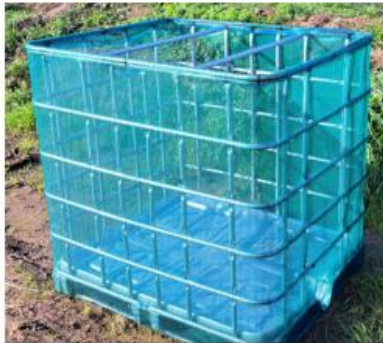
Example of a 'box' type fish screen.