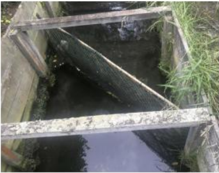
Example of a 'fence' type fish screen.

On Council projects, fences are typically used where fish must be excluded from a length of waterway where the passage of water must be maintained. They work well in steep sided waterways such as box culverts. Box screens are most commonly employed on a pump intake hose and can be used in any waterway that is large enough to accommodate a suitably sized box.