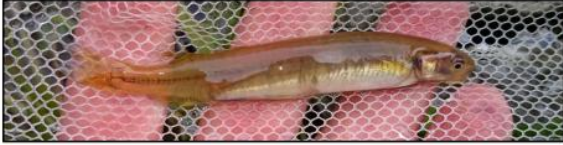
Figure 3: An adult inanga. Juvenile inanga are commonly known as whitebait. Inanga are classified as an At Risk species in decline 2 .