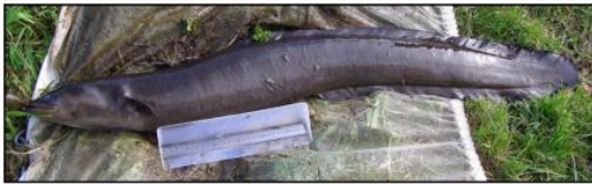
Figure 2: A large longfin eel caught in a Canterbury waterway. Longfin eels are an At Risk species in decline 2 .