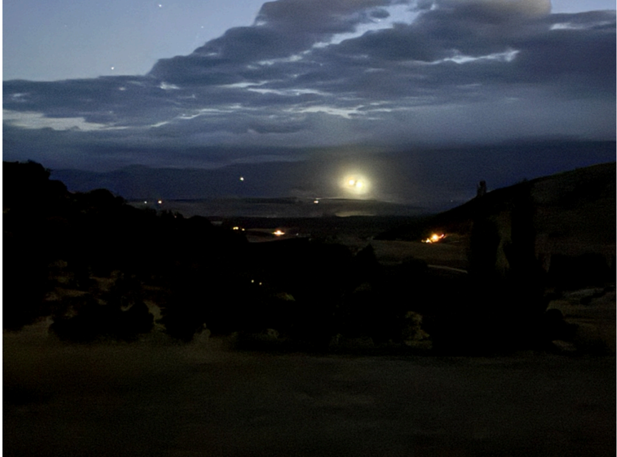
Photo 3: 9:20pm two light towers (one on the CIT pit and one on the RAS pit) both pointing away from the hill towards the valley and two “trucks”