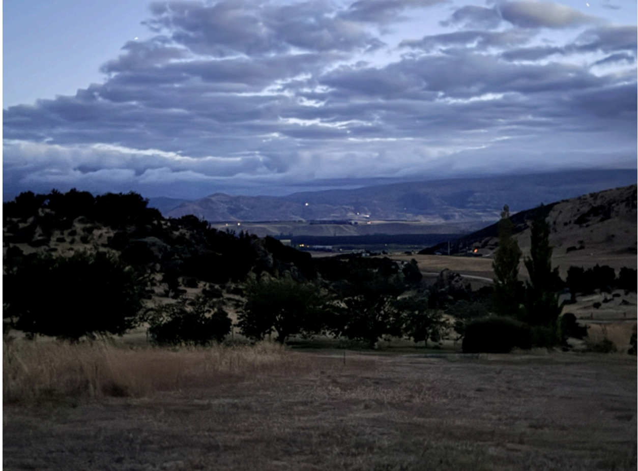
Photo 1 : taken at 9:04pm, without external lighting, note the unidentified light source observed on the hill, this is on the proposed Adgour Track route from what we could observe