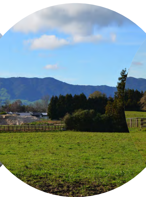
Within Site viewing East