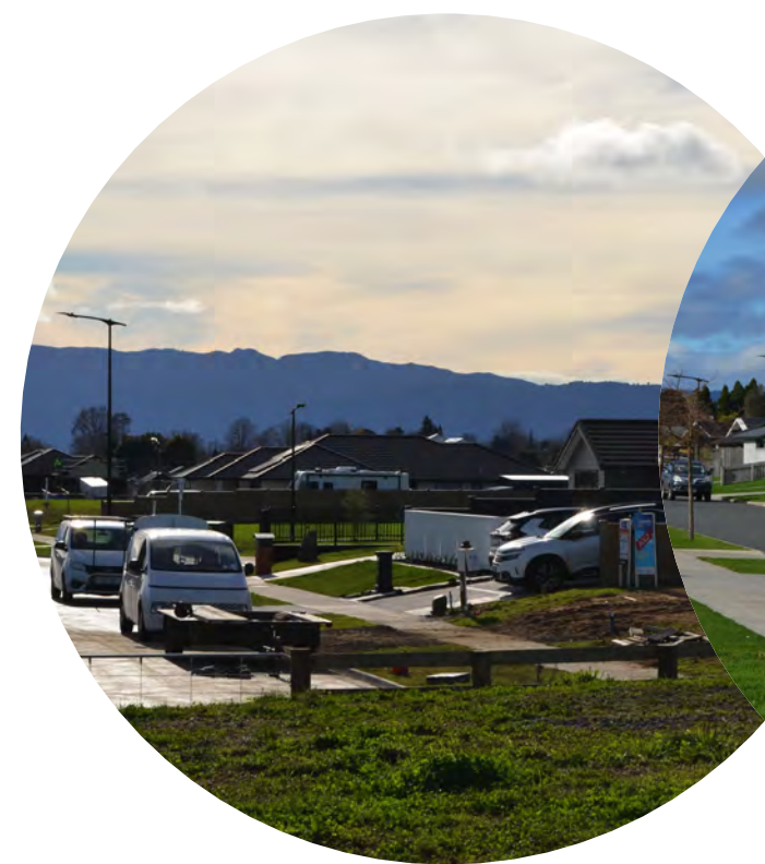
Neighbouring Residential Development