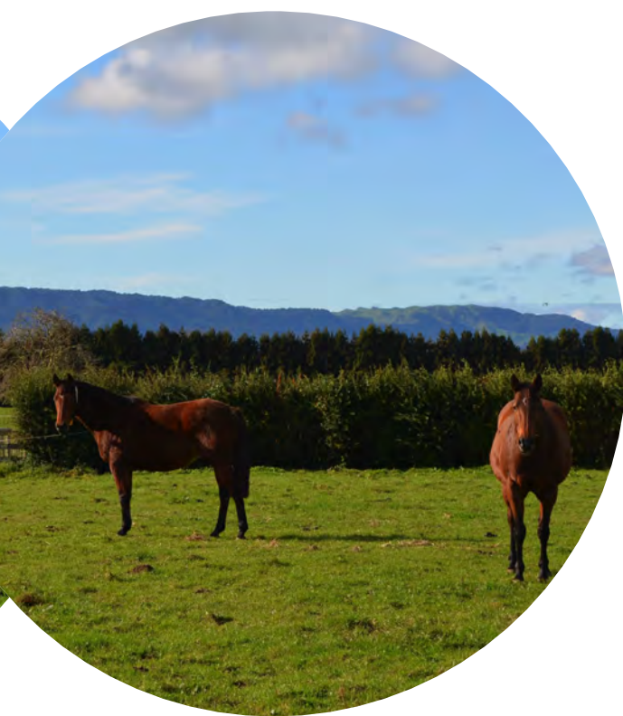
Within Site viewing West