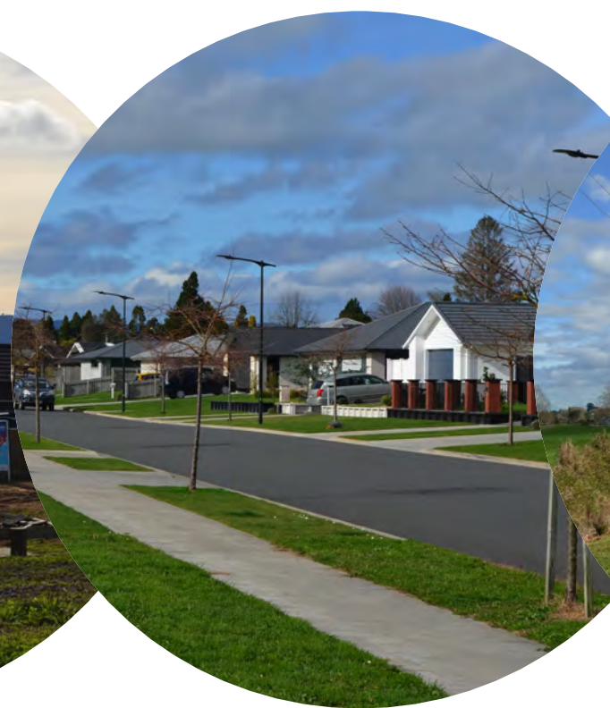
Neighbouring Residential Development