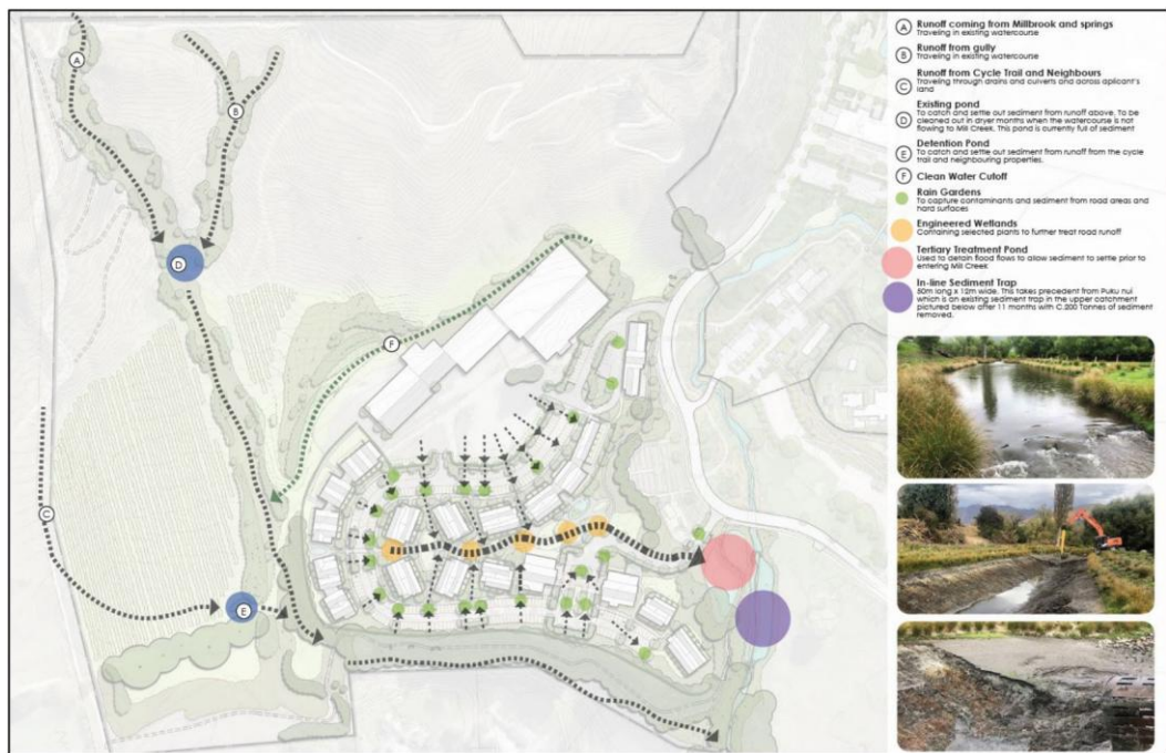
Figure 4: Stormwater Overview Plan

[765] The figure cross referenced is reproduced as Figure 4: