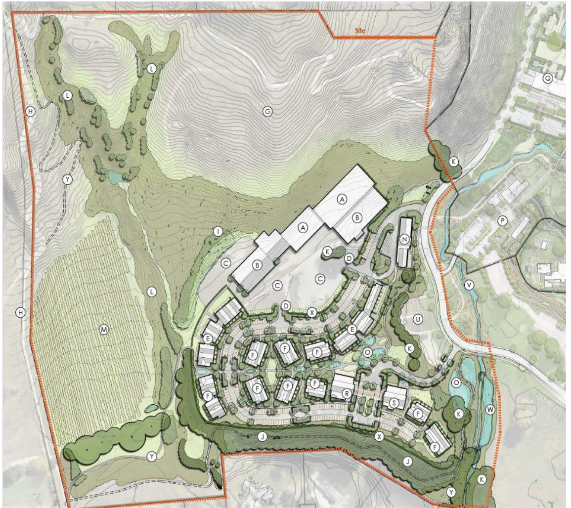
Figure 1: Outline of the proposed project