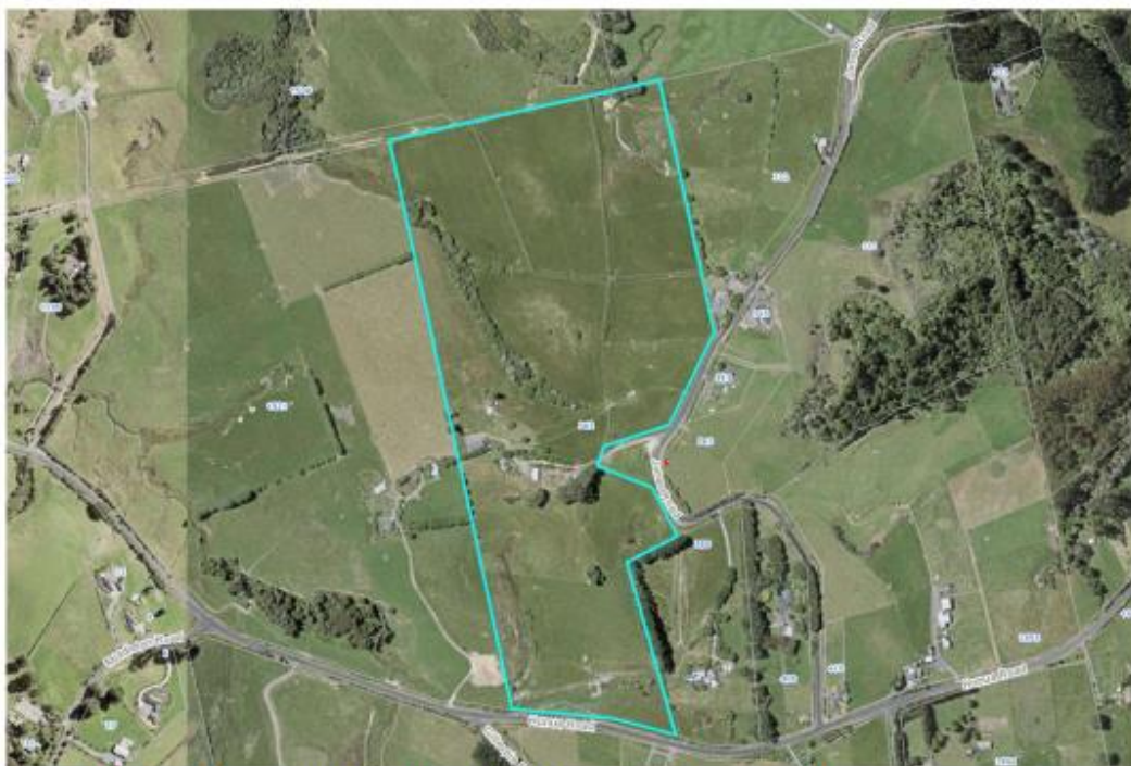
Figure 2: Subject site- 362 Jones Road