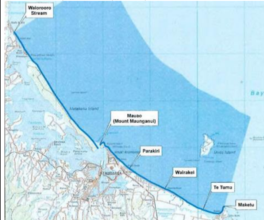
Ngāi Te Rangi and Ngā Pōtiki Deed of Settlement Schedule - Attachments 14 Dec 2013 (p19)

Statutory area: Waiorooro ki Maketu, being the area within the marine and coastal area (as defined in section 9(1) of the Marine and Coastal Area (Takutai Moana) Act 2011) from Waiorooro Stream to Parakiri (recorded name being Omanu Beach).