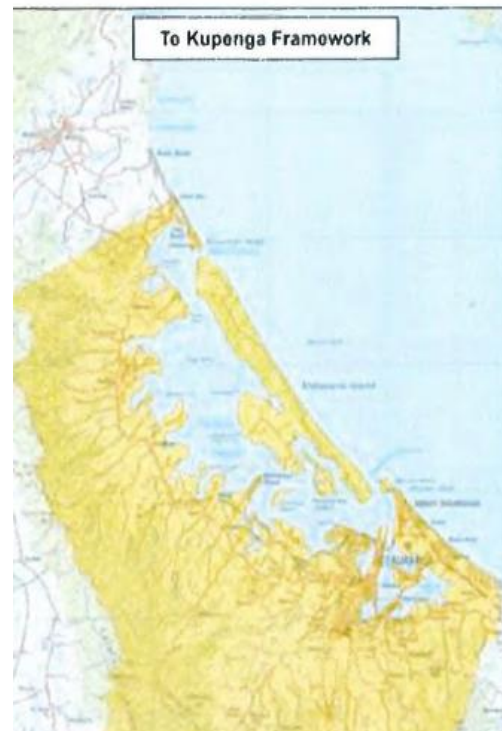
Te Kūpenga Area