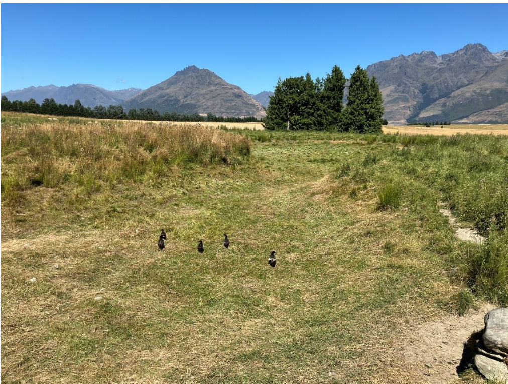
Plate A4-4 – Pūtangitangi/paradise ducks within the currently dry modified pond near northern end of the property.