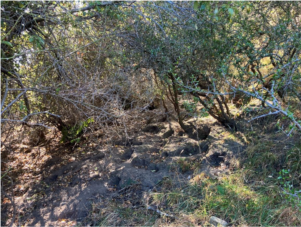
Plate A4-5 – European rabbit burrow under the tūmatakura -(mikimiki-sweet briar) scrub.