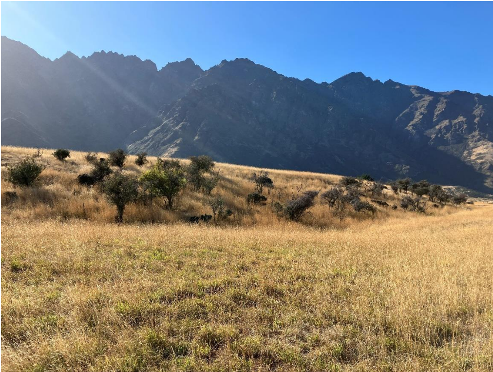
Plate A4-3 – Less dense tūmatakuru shrubland on a terrace near the mid-section of the property.