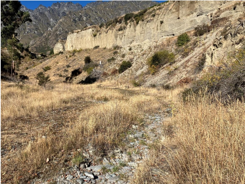
Plate 3 – [Kōhuhu]/mikimiki-sweet briar shrubland on the lower slopes below the cliffs in the southern gully. Stonefield/ephemeral stream on the flat gently sloping gully bottom.