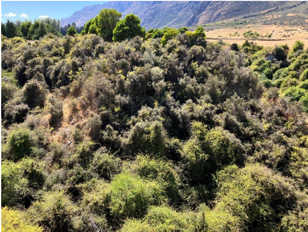
Plate 2 - Blackwood/elder-mikimiki-puka scrub in the mid-section of the southern gully.

The mid-section of the southern gully is dense with mikimiki, elder, puka/large-leaved muehlenbeckia ( Muehlenbeckia australis ) and blackwood ( Acacia melanoxylon ) on the upper gully margins (Plate 2).