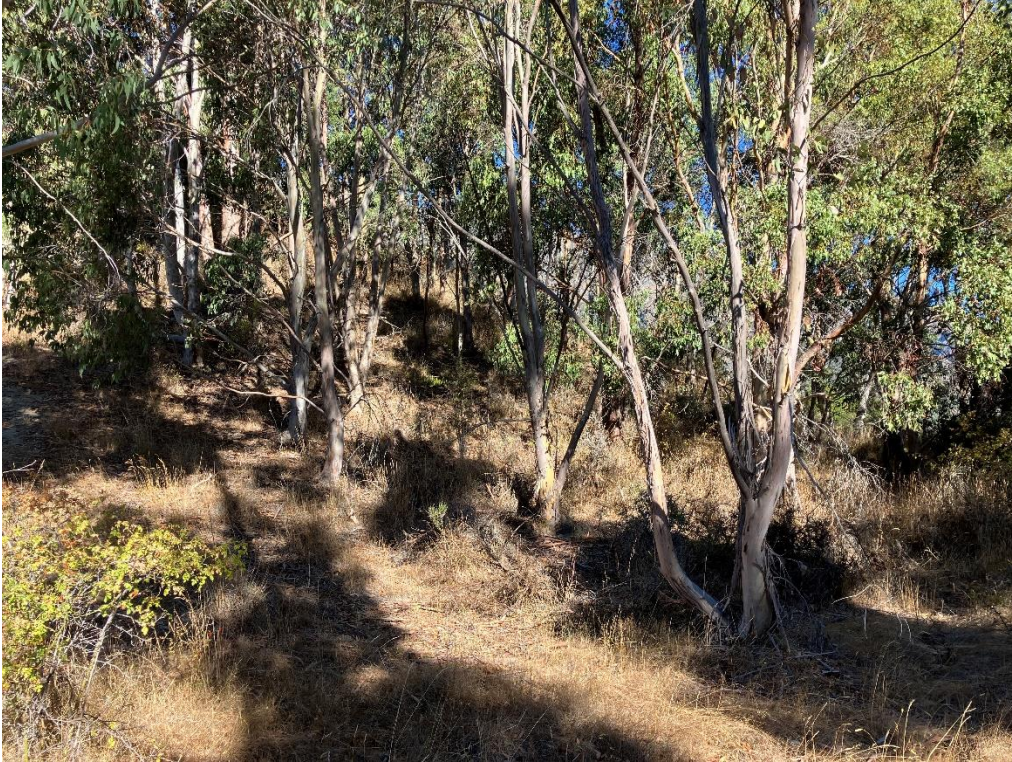
Plate A4-1 – Blue gum/(mikumiki-sweet briar) treeland in the southern gully.