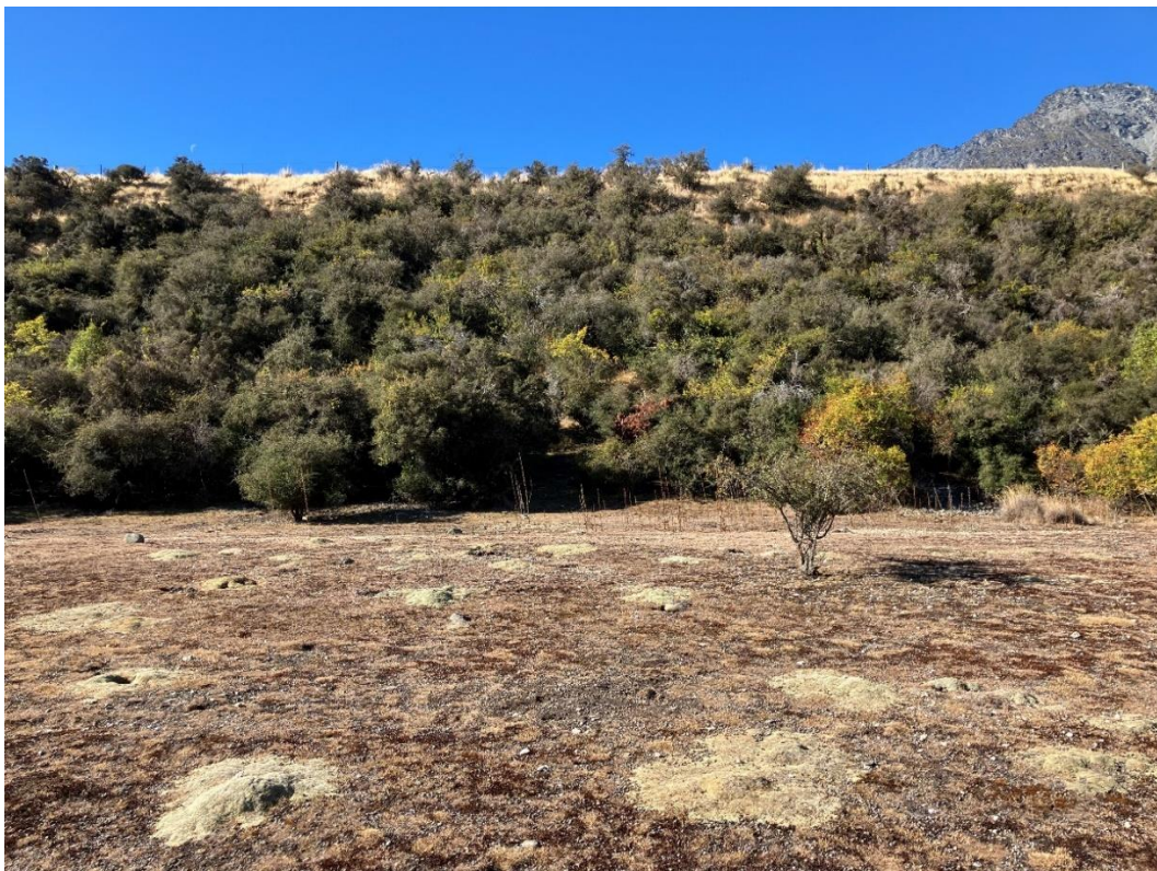
Plate 1 - Tūmatakuru -(mikimiki-sweet briar) scrub on the terrace slope and (common mat daisy) mossfield on the terrace.

The tūmatakuru -(mikimiki-sweet briar) scrub is a regenerated indigenous scrub on the lower terrace slope above the lake margin (Plate 1). Tūmatakuru/matagouri and mikimiki range from 0.5-3.0 metres tall throughout. Kōhuhu is emergent near the southern end of the scrub. Rare and emergent exotic tree elder ( Sambucus nigra ) is present along with the occasional radiata pine ( Pinus radiata ) saplings. Exotic shrubs scattered within the scrub include sweet briar (more common) and occasionally Scotch broom. The hemiparasite pirita/green mistletoe ( Ileostylus micranthus ) is present on mikimiki, tūmatakuru/matagouri and sometimes Scotch broom. The understorey of the scrub ranges from bare soils to areas of exotic grasses. Some species in the understorey species include male fern, necklace fern ( Asplenium flabellifolium ) and porcupine shrub ( Melicactus alpinus ) near the scrub edges.