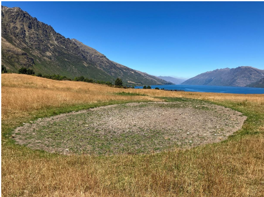
Plate 4 – Ephemeral wetland on the upper terrace near the southern end of the property.

One ephemeral wetland is located in between the gullies and is a mostly unvegetated oval depression (Plate 4). Scattered exotic species located near the edges of the wetland include floating sweetgrass ( Glyceria fluitans ), browntop ( Agrostis capillaris ), clammy goosefoot, white clover ( Trifolium repens ), and black nightshade ( Solanum nigrum ).