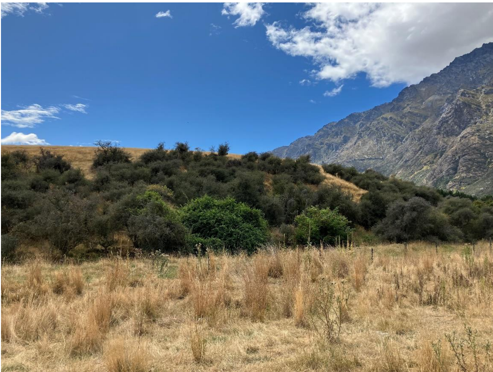
Plate A4-2 – Dense tūmatakuru shrubland on lower hills slope at the northern end of the property.