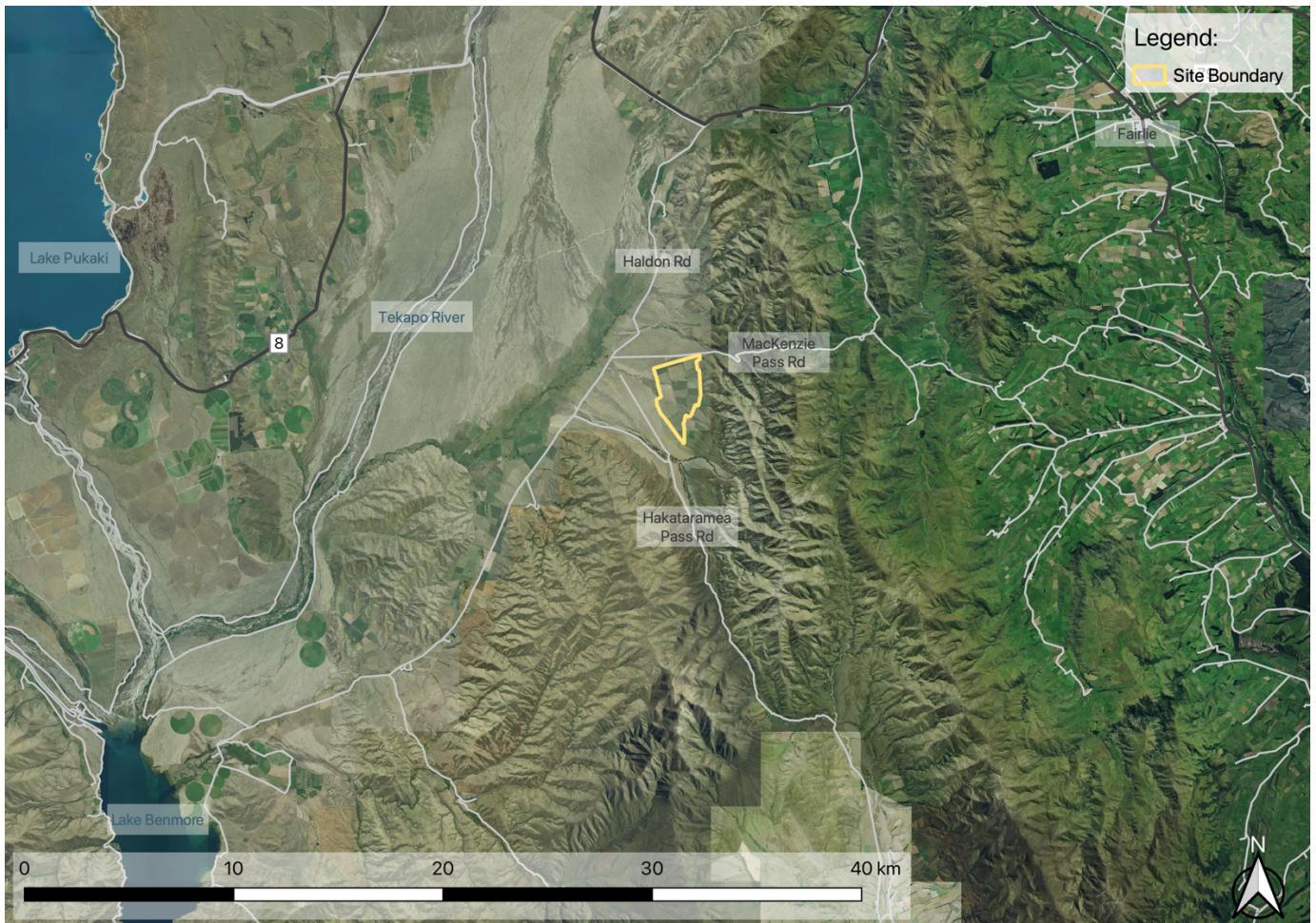
Figure 1: Location of the Grampians Solar Project

The Grampians Solar Project is located between MacKenzie Pass Road to the north and Hakataramea Pass Road to the west. Figure 1 shows the location of the solar farm in relation to the local road network.