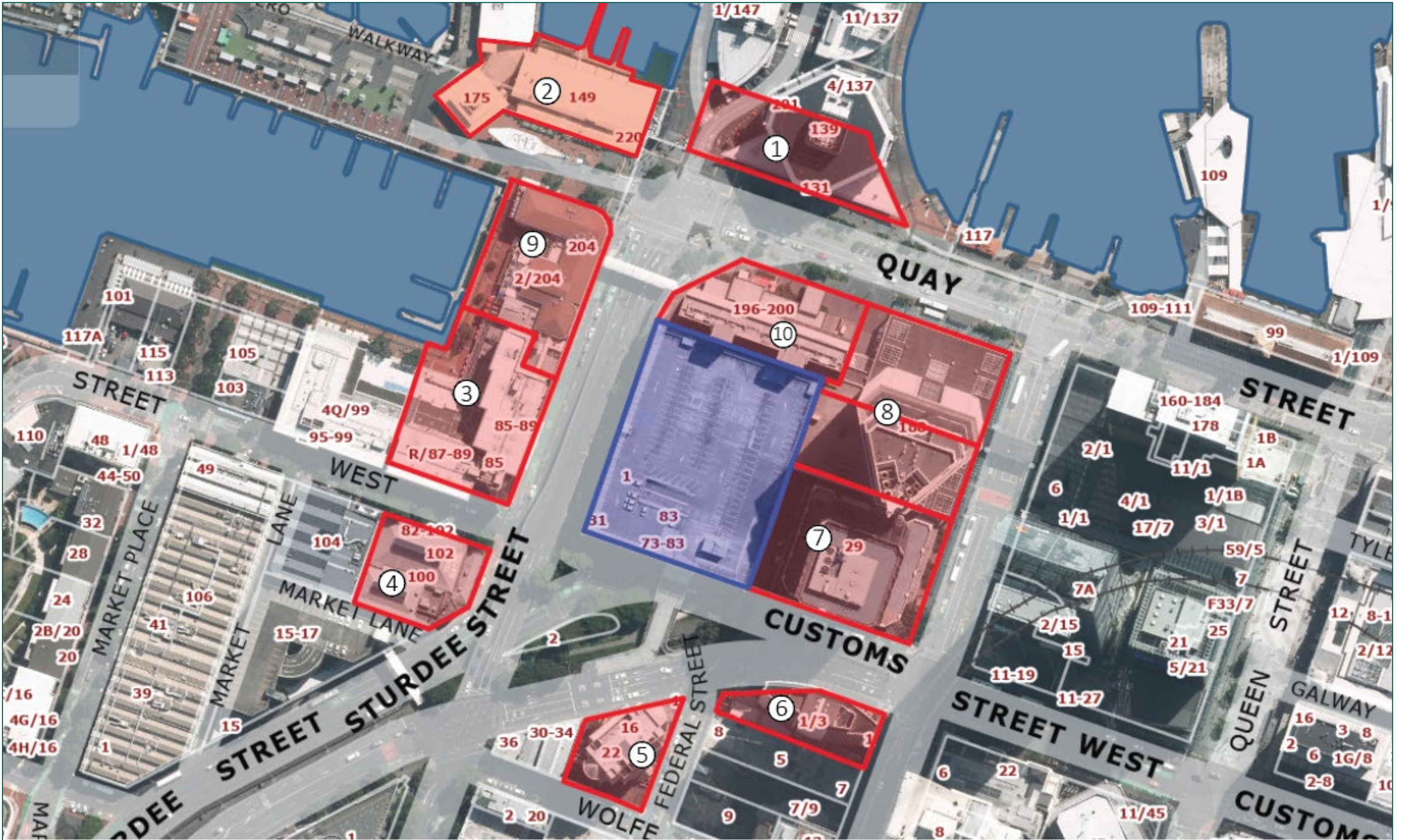
Figure 1. Adjacent neighbour location reference.