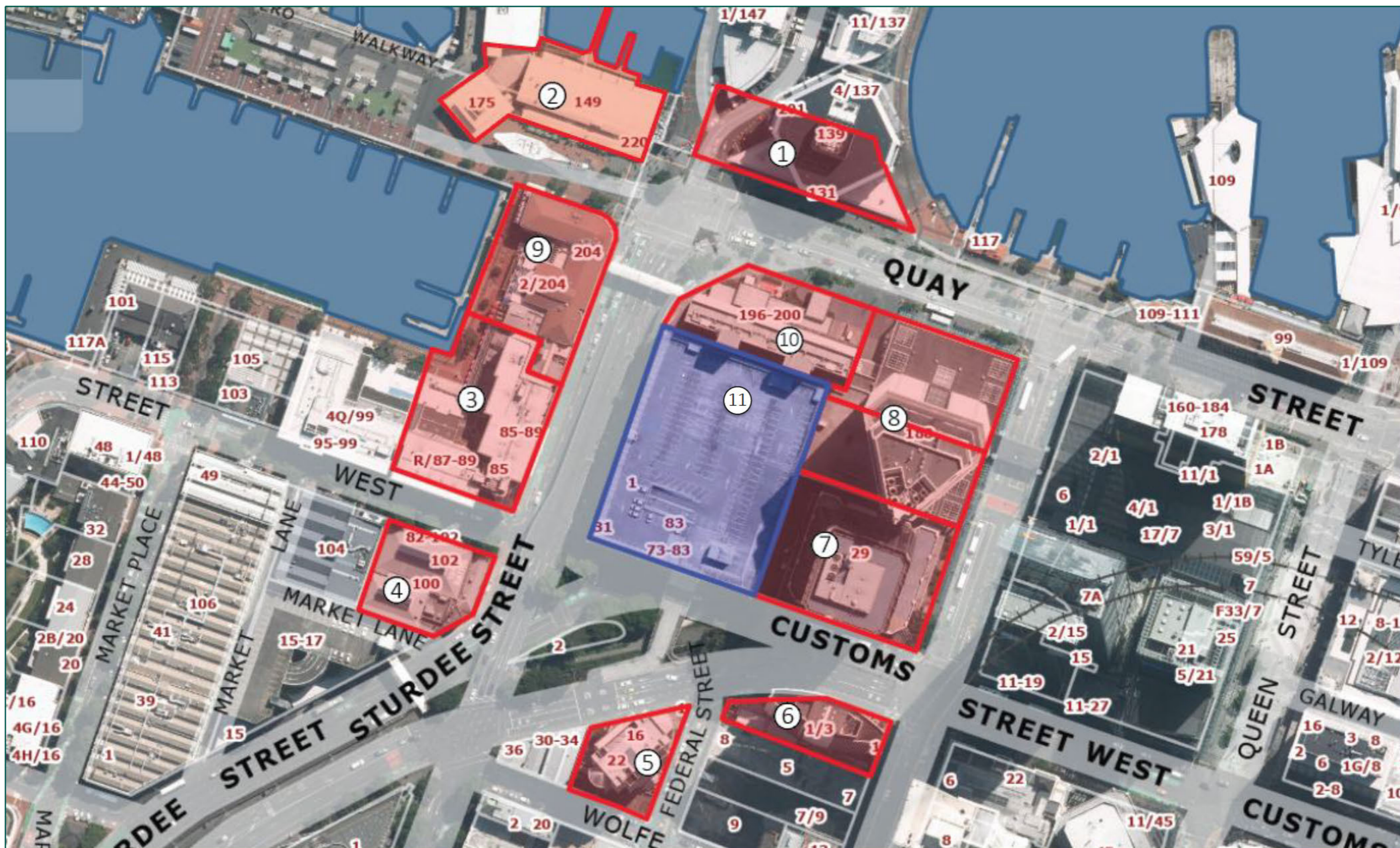
Figure 1. Adjacent neighbour location reference.