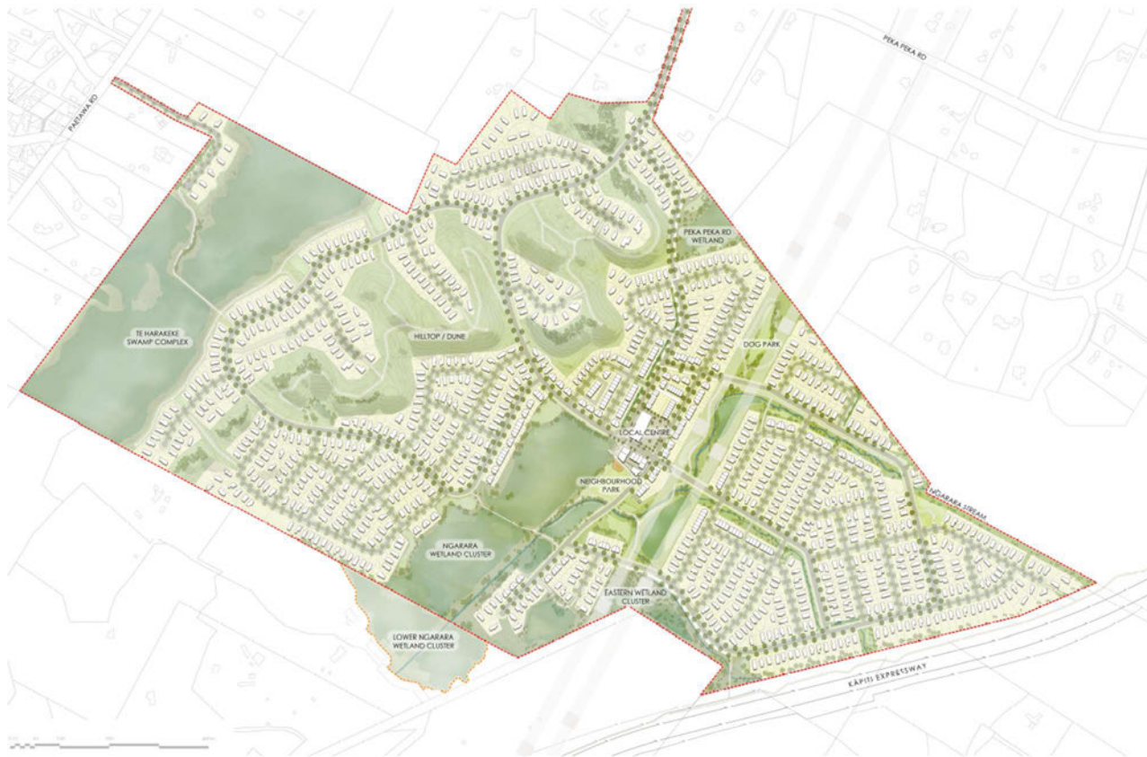
Figure 1 Taken from the email received 26 March 2026.

Figure 1 is taken from the email provided 26 March 2026 and shows the site boundaries inclusive of the easement area of 55 End Farm Road, Waikanae.