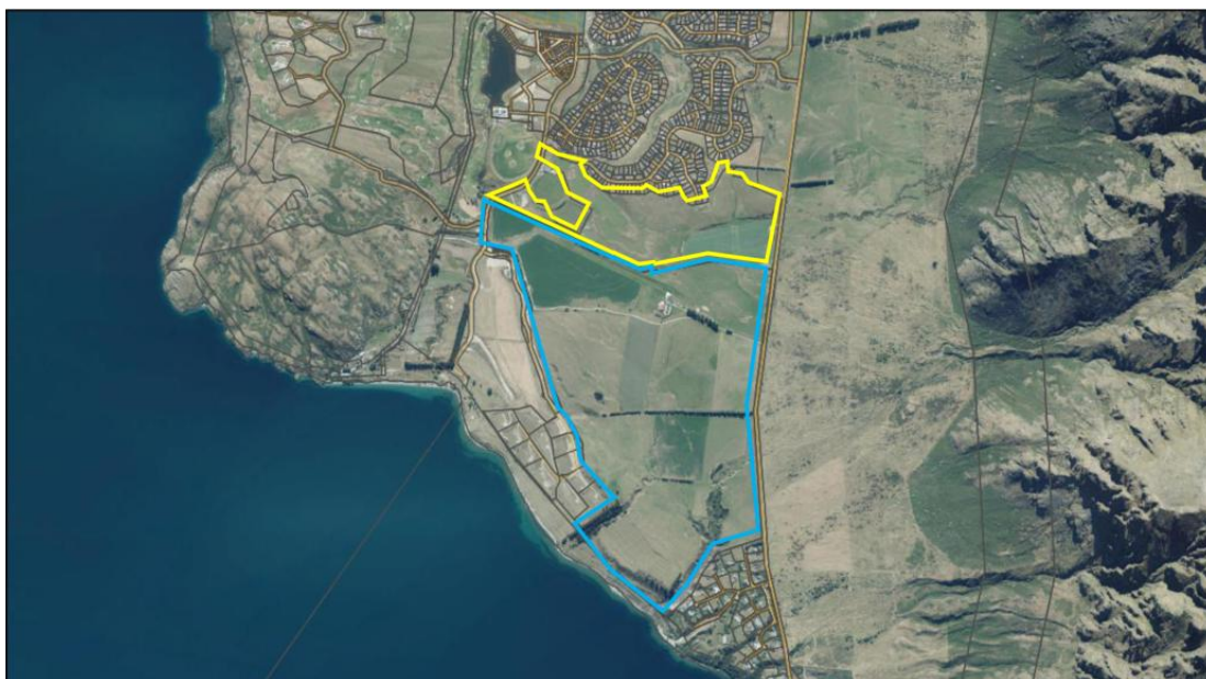
Figure 1 Location of Application Site. Lot 12 shown in yellow outline and Lots 8 in blue outline.