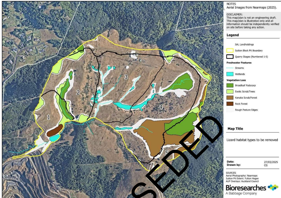
Figure 3: The vegetation marked for removal at Drury Quarry – Sutton Block.