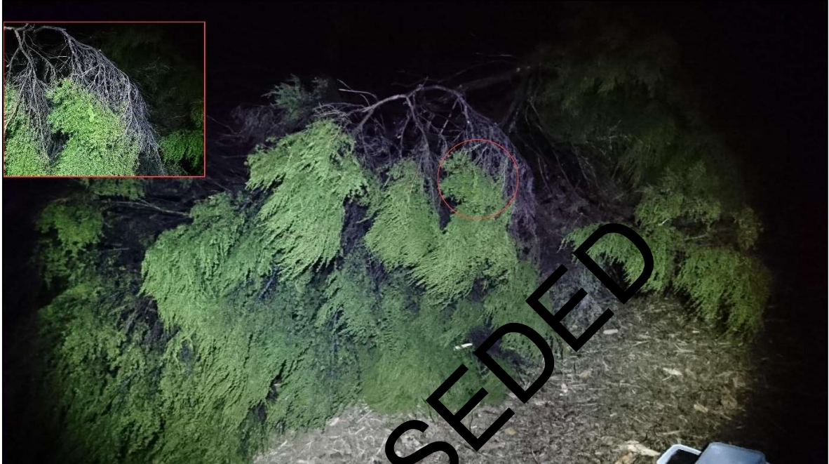
Figure 5. ‘At Risk’ elegant gecko on kōhūka, approximately 1 week after felling (refer red circle and inset image).