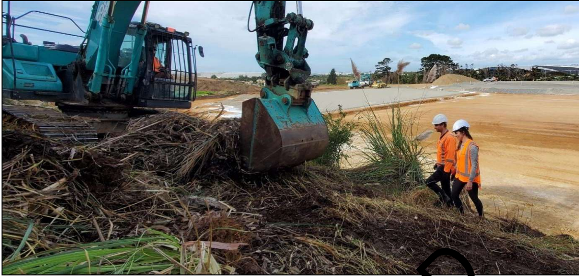
Figure 6. Machine-assisted lizard searches. Herpetologist supervising the scraping of terrestrial vegetation.