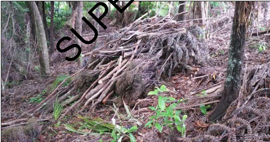
Figure 8. Example of ecostack / stacked brush pile as a supplementary refuge for relocated lizards.

Following completion of lizard salvage for each stage, a further five ecostacks will be provided at the relocation site as advance habitat provision for lizard salvage at future stages.