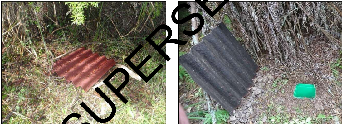
Figure 4: Artificial retreat (L); Pitfall trap with AR cover (R).