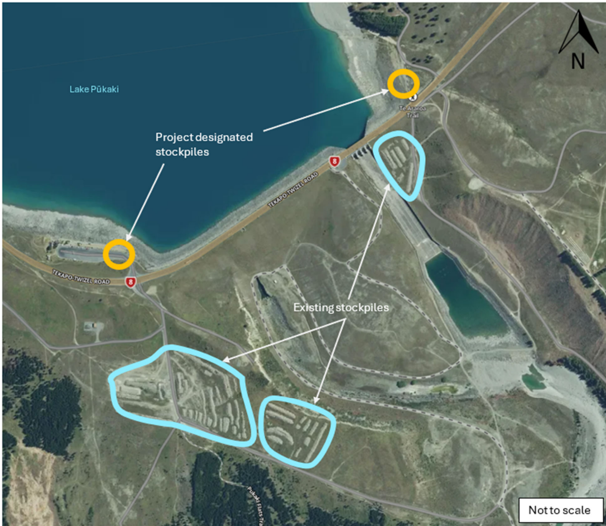
Figure 1 Stockpile locations