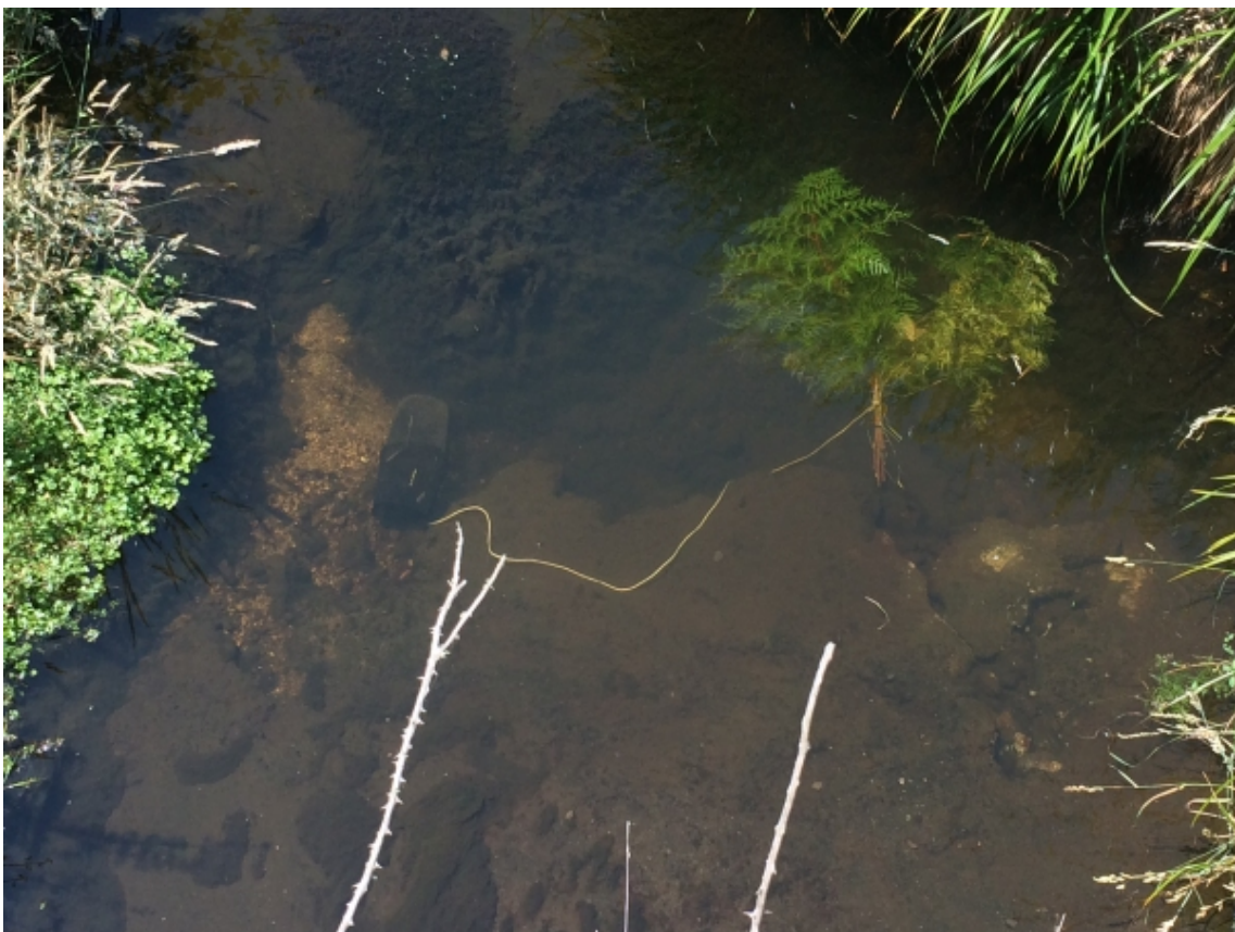
Figure 3. Whakaweku set in a small stream.

You can set whakaweku anywhere in a stream where the water depth is greater than about 50 cm, including in deep pools, beneath undercut banks or mid-stream. The whakaweku work even if they are not fully submerged in water.