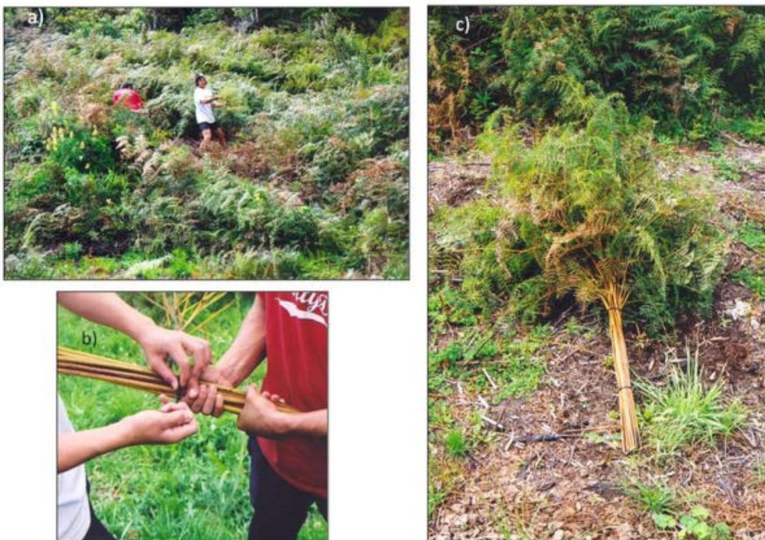
Figure 1-1. Constructing a whakaweku (fern bundle) for catching kōura: (a) collecting bracken fern, (b) binding 10-12 bracken fern fronds together using cable ties, and (c) a finished whakaweku ready for use.

Construct bundles of about 10-12 fronds by binding their stems together. Using strong plastic cable ties, adjust the fronds so that they form an open bunch, and cut the ends off the fern bundles to make a “handle” (Figure 1-1)