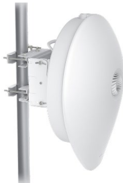
Figure 1. Option for upgraded Wireless bridge - Ubiquiti UISP airFiber 60 XR 60GHz Long Distance PTP Bridge

Higher bandwidth options, such as the 'Ubiquiti UISP airFiber 60 XR 60GHz Long Distance PTP Bridge' (pictured below) are rated for up to 5.4Gbps (5,400 Mbps), i.e. more than 10x the bandwidth of the existing connection. This is expected to be more than sufficient for the expansion project 'if completed today' and it is anticipated that any incremental increase in demand at the time of construction could be compensated by equivalent improvements in available technology.