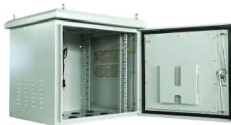
Figure 4. Field Communications Cabinet (approx. dimensions: 600mm wide x 600mm deep x 400mm high) - Typical for reference, to be installed nearby to plant

Various field equipment and plant items for other infrastructure packages, as listed/described above, require communications connectivity for controls and/or monitoring. These connections are generally proposed to be via cabling to the nearest backbone infrastructure connection point. In many cases this will be a fibre optic cable connection due to length, which does also mean that a small network switch and field cabinet or other enclosure would be required at the plant/equipment location. These enclosures would be proposed as weatherproof including anti-condensate/anti-freezing internal heaters. Low Voltage power would generally be required to the plant/equipment requiring a communications connection in any case, and so a small power supply should be readily available at each plant location. Plant with multiple units in close proximity (e.g. snow making machines) could potentially have one cabinet between several units. Buried pit options may also be viable in some cases.