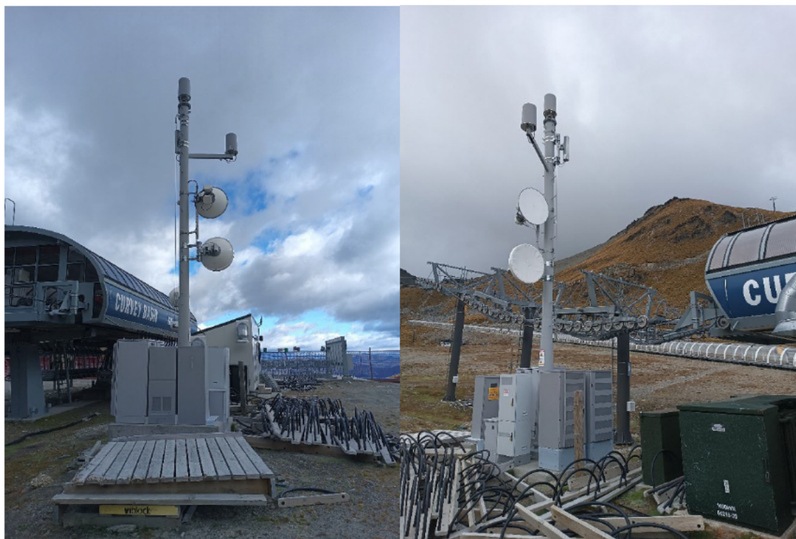
Figure 2. Existing hardware - Remarkables telecommunications link (wireless bridge) connection to Coronet Peak

An upgrade to wireless bridge hardware is significantly more cost-effective than a buried fibre connection for the Remarkables site; in the order of $15,000, depending on the exact product and installation complexity.