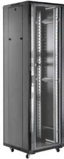
Figure 3. Building Communications Cabinet (approx. dimensions: 700mm wide x 850mm deep x 2100mm high) - Typical for reference, to be installed within dedicated room

The scope/extent of this package of works within the context of the infrastructure planning project is to be discussed and agreed with NZSki as part of future design stages.