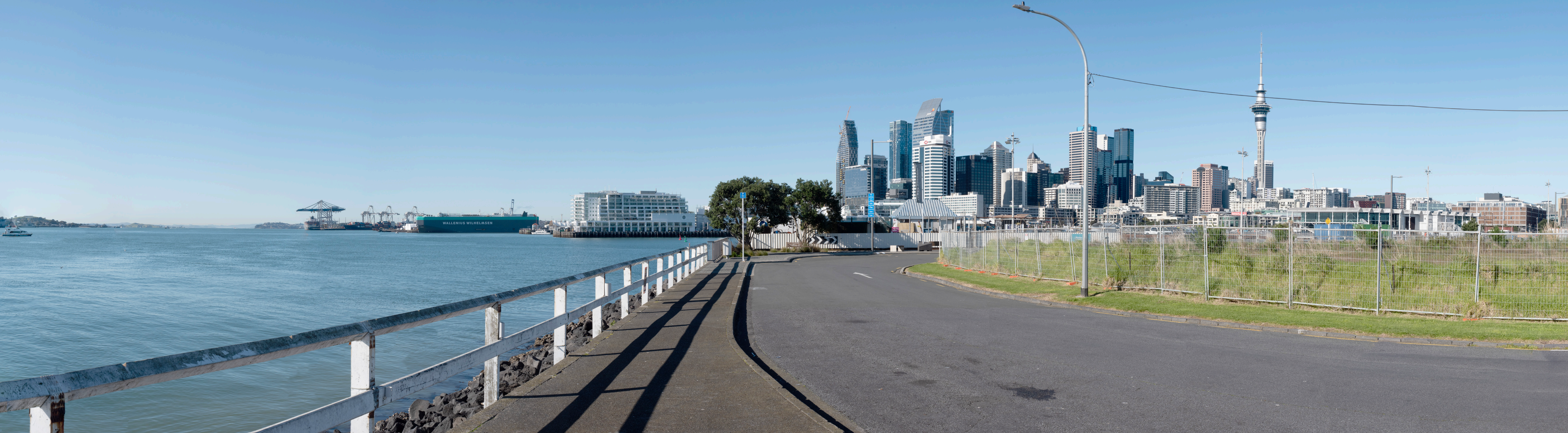
Figure 14 - Viewpoint 7 - Existing

View from Hamer Street / Brigham Street (Wynyard Point) looking southeast.