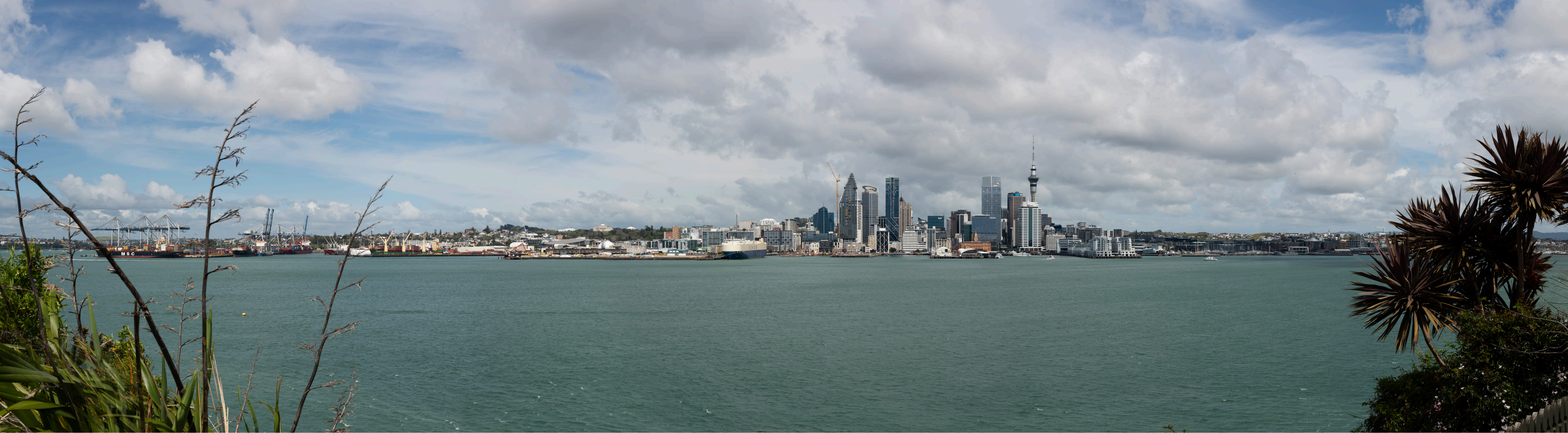
Figure 16 - Viewpoint 8 - Existing

View from Cyril Bassett VC Lookout, 87 Stanley Point Road looking south.