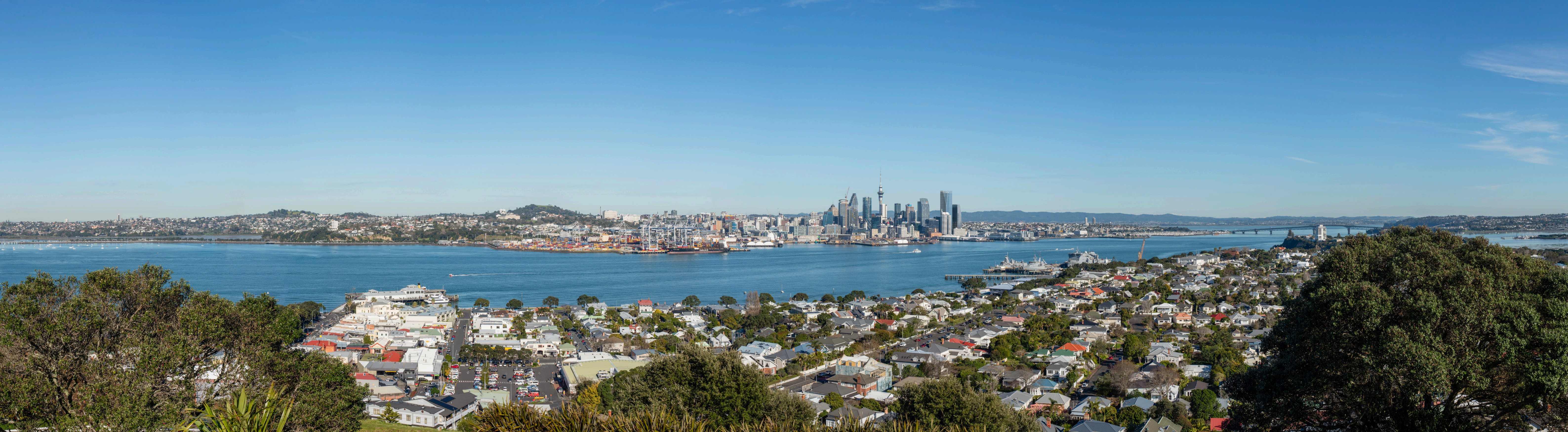
Figure 19 - Viewpoint 9 - Proposed

View from the summit of Takarunga (Mount Victoria) looking southwest.