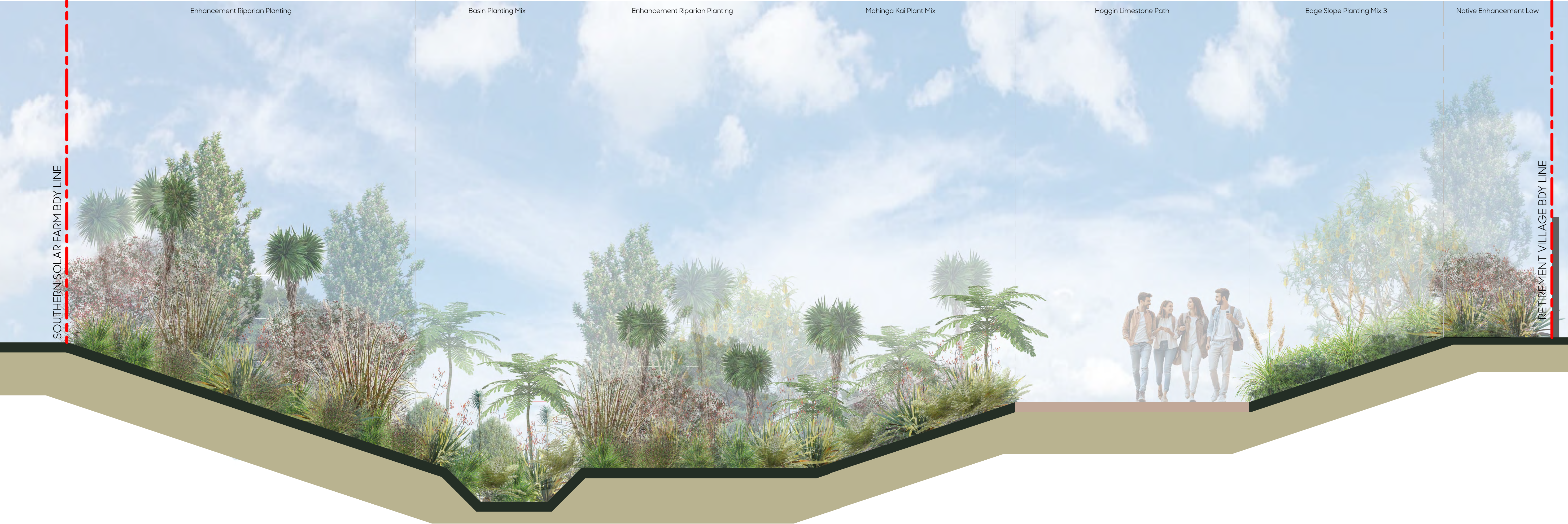
TYPICAL SECTION : GREENWAY 1:30@A1 / 1:60@A3 NOTE: VEGETATION SHOWN AS INDICATIVE OF 10-YEAR MATURITY