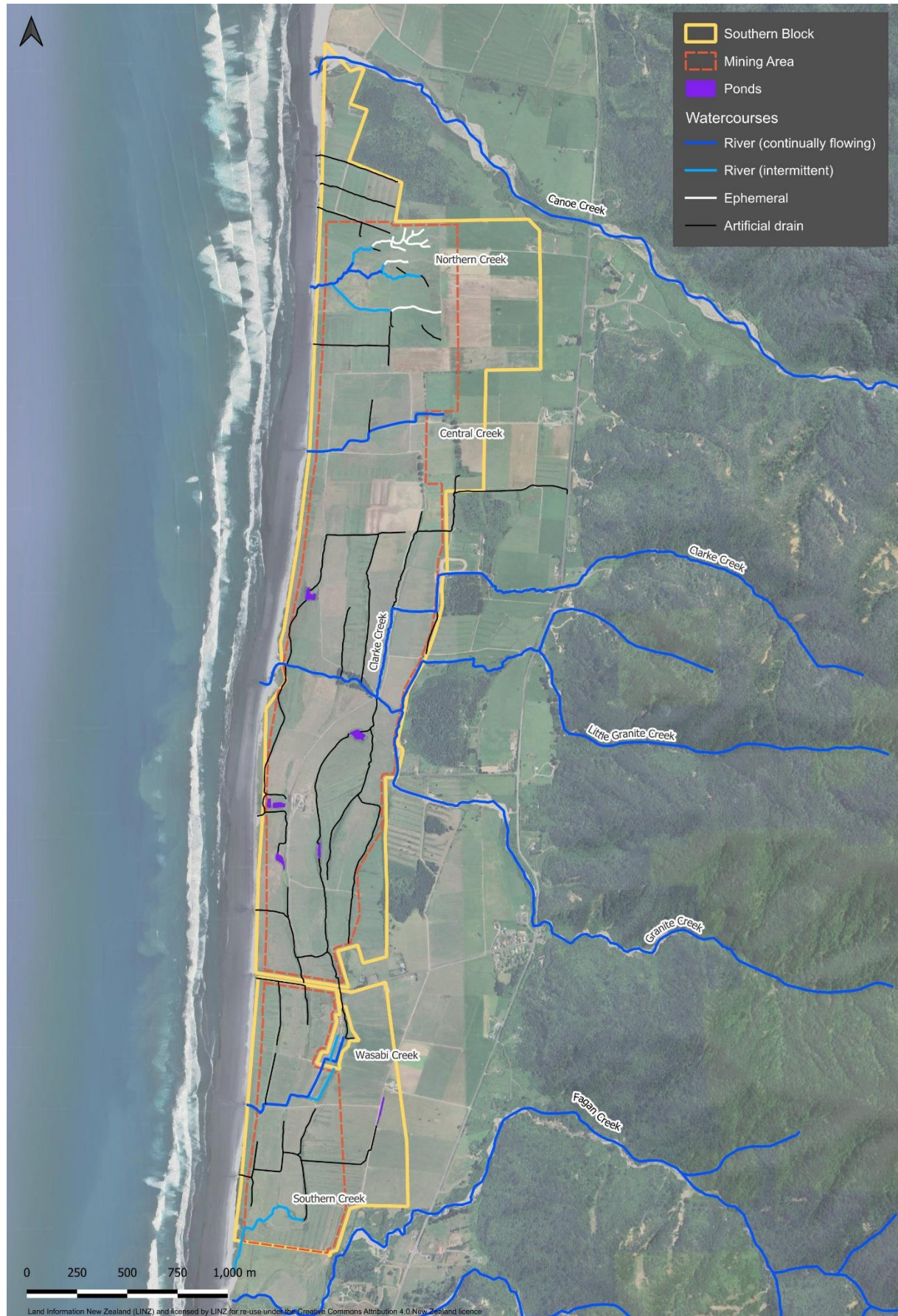
Figure 2: Watercourses within Tāiko Critical Minerals' Southern Block.