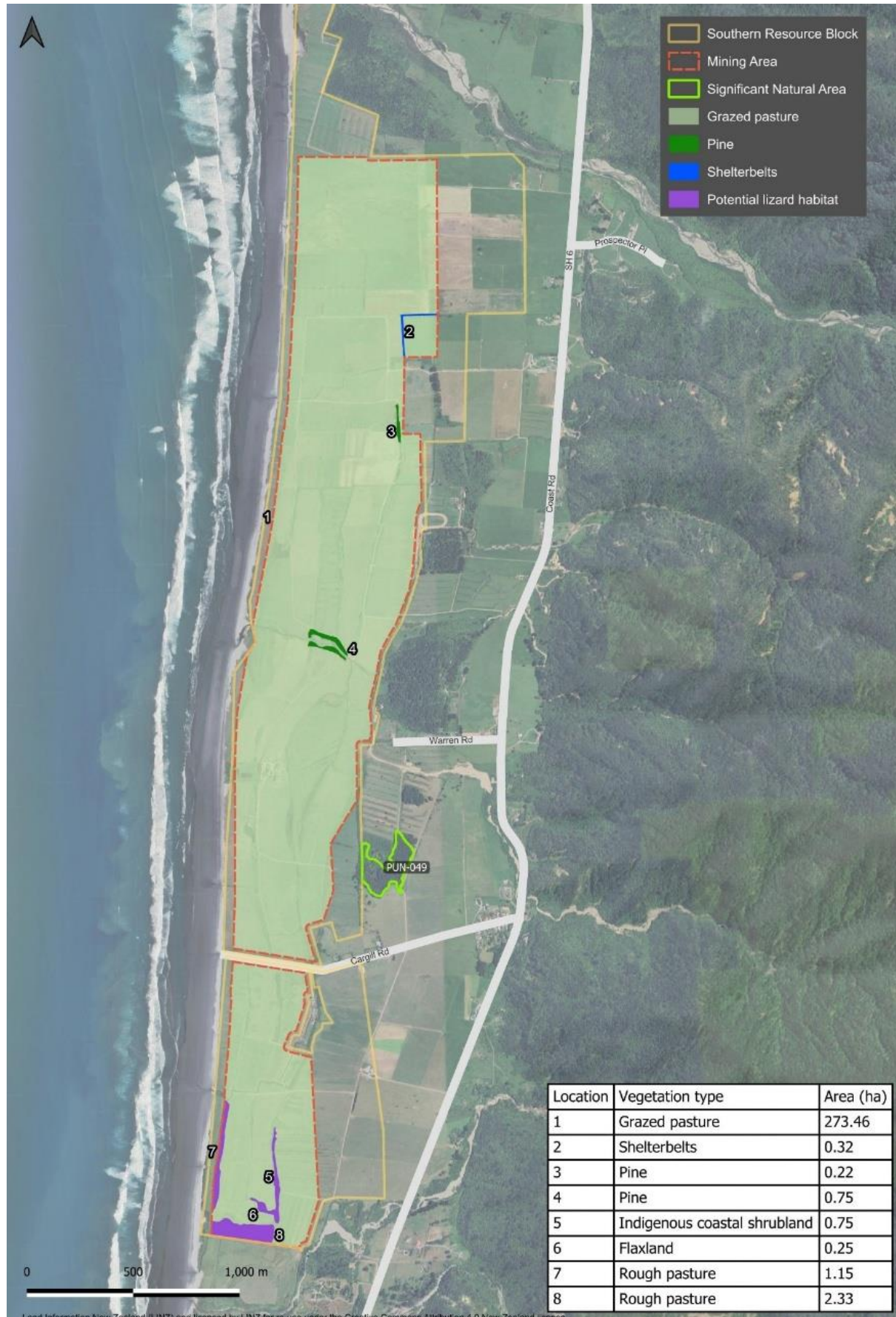
Figure 3: Potential lizard habitats within Tāiko Southern Block, Barrytown.