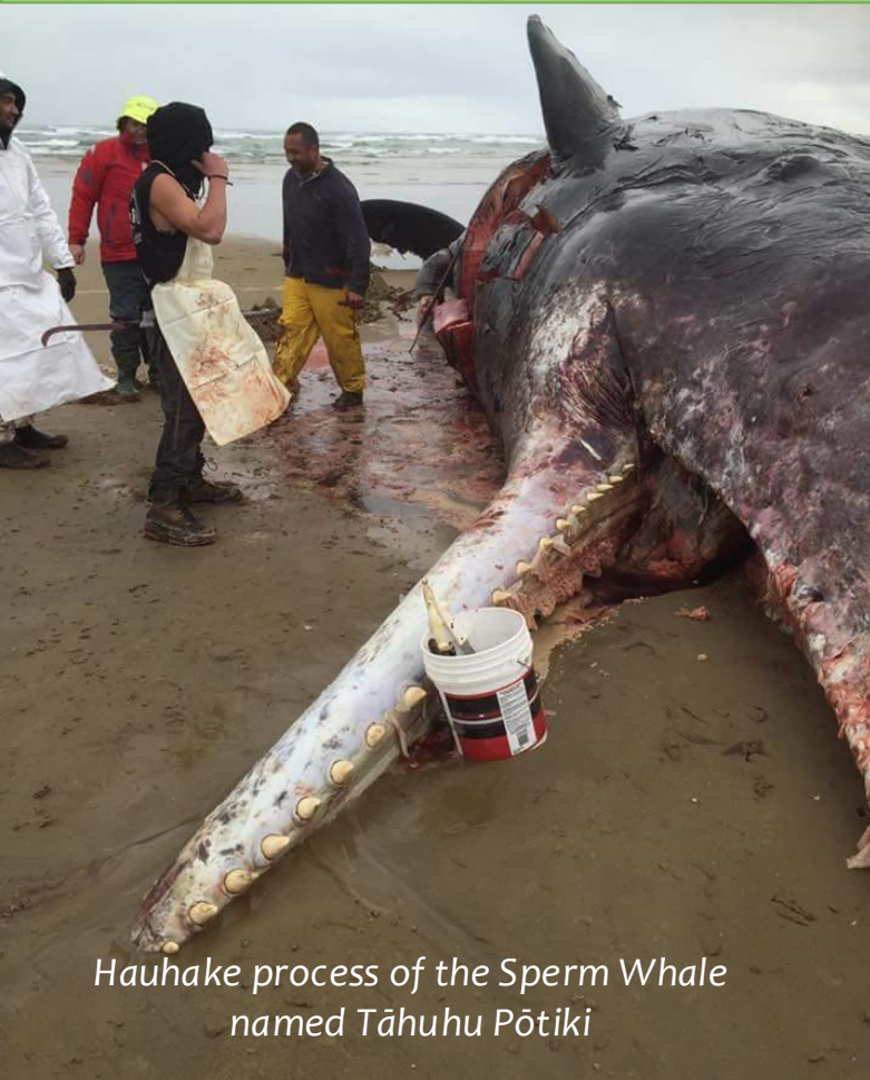
Hauhake process of the Sperm Whale named Tāhuhu Pōtiki