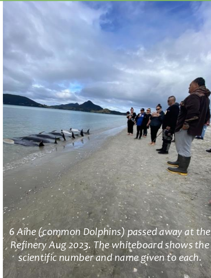
6 Aihē (common Dolphins) passed away at the Refinery Aug 2023. The whiteboard shows the scientific number and name given to each.